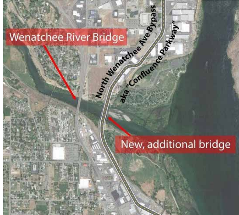
The proposed Confluence Parkway would provide a much-needed second bridge across the Wenatchee River, a widened pedestrian bridge, and a roadway with a direct connection to the U.S. 97A/US 2 Interchange and Odabashian Bridge.