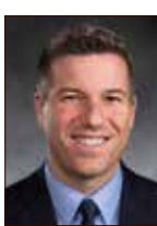
COMMUNITY VOICES By BRAD HAWKINS

Last year's legislative session concluded with the approval of a 16-year, $16.9 billion transportation investment plan, known as "Move Ahead Washington." The long-term plan primarily funded preservation and maintenance of our existing transportation system as well as new, large-scale construction projects. Despite being a 16-year plan with numerous projects funded, the legislation did not include its typical "aged and phased" project list, which itemizes each project's funding over the duration of the plan.