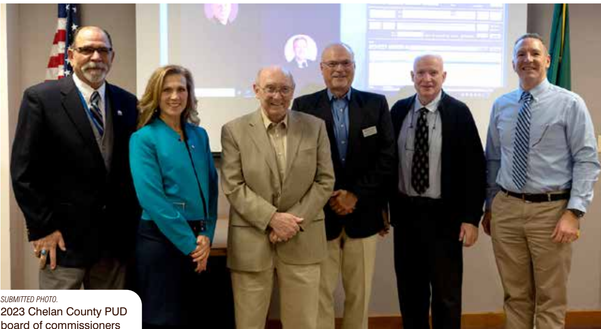
2023 Chelan County PUD board of commissioners

In other news, commissioners thanked staff for their efforts to restore power during a record-breaking cold snap, and also during several tree-caused outages over the last three weeks. They also celebrated a re-affirmation by Standard and Poor's rating agency of Chelan PUD's AA+ credit rating with a stable outlook.