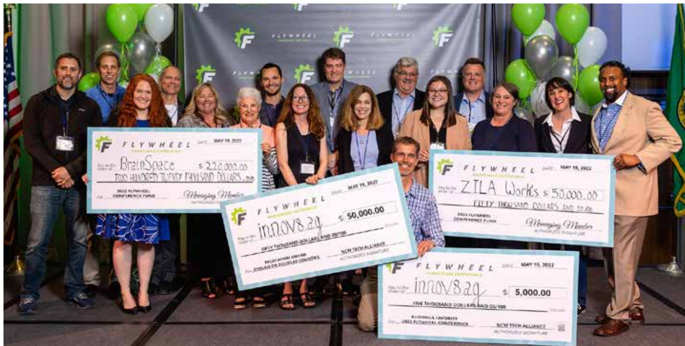
Group photo of award winners from the 2022 Flywheel Investment Conference