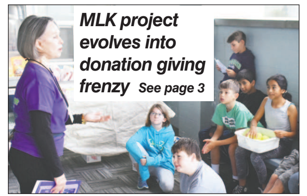
MLK project evolves into donation giving frenzy See page 3