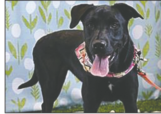
Remy Age: 1 year • Sex: Spayed Female Breed: Labrador Retriever/Boxer mix Animal ID: 33374885 • Adoption Fee: $200