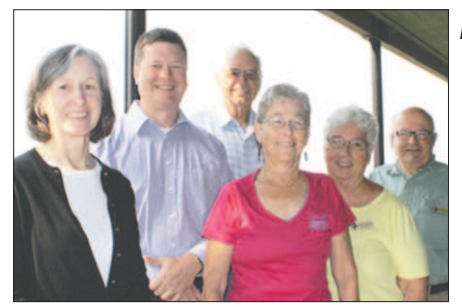
LCCHC Board holds retreat