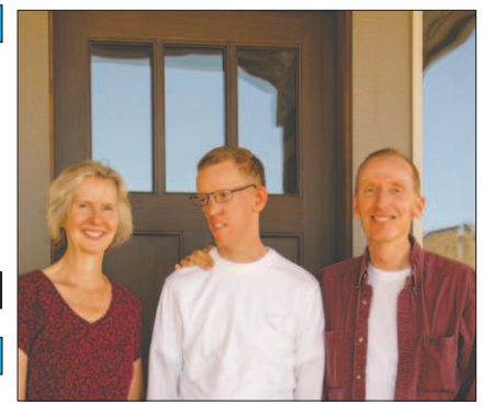
Ridgeview Place to hold open house, concert