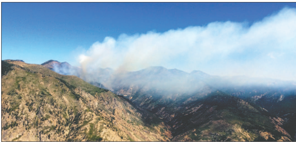
Smoke moves down lake from the Uno Peak Fire 15 miles northwest of Manson, WA on August 31, 2017. Below: Map of the Uno Peak fire along Lake Chelan.