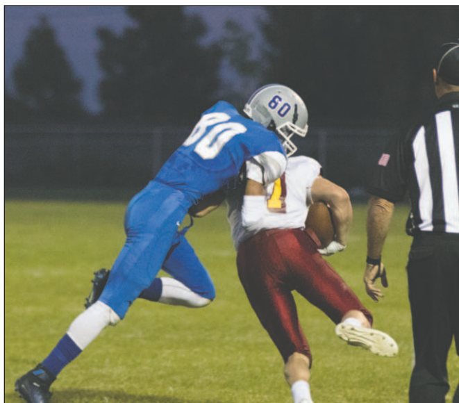
#80 sacks a Raider's receiver, grounding the play with minimal yards gained.