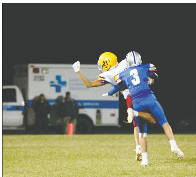
#3 denies a touchdown attempt, blocking a Raider's receiver from completing the scoring reception.