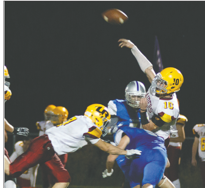
Trojans tore down Lake Roosevelt Raider's attempts in scoring during the first home game of the season, Monday, Sept. 11. Trojans took the win over the Raiders with a final score of 14-8.