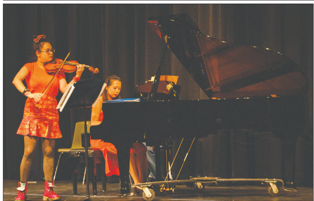
Deviatkina-Loh (on violin) and Chen (on piano) performed several classical pieces, and answered some questions from the audience following the performance.