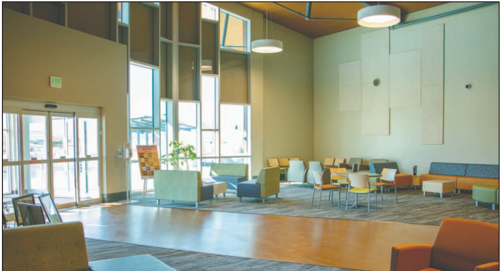
Medical office entrance and waiting area.

By MIRROR STAFF office for assistance at (509) 667-6808. Ballot to be mailed Ballot will be mailed Friday, Oct. 20. Chelan County is a vote by mail county. All voters will receive their ballots in the mail and accessible voting equipment is available. The County Courthouse will remain open for ballot drop-off and use of the accessible voting equipment 18 days prior to Election Day. Official ballot drop box sites are also available 18 days prior to Election Day, and sealed at exactly 8 p.m. on Election Day. In Chelan, behind Chelan City Hall on Johnson Avenue and at Entiat City Hall located on Kinzel Street. Both are drive-thru drop off boxes.