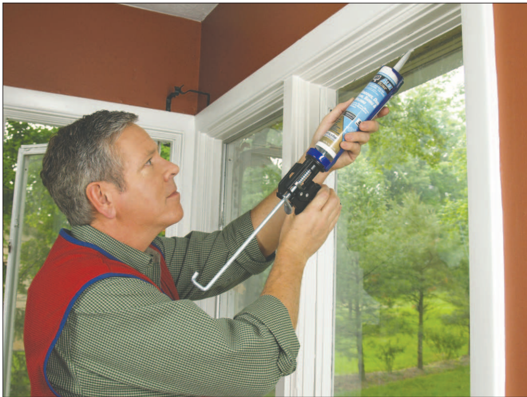
BPT Photo Caulk around windows and doors - Air can also leak through minute cracks around windows and doors.