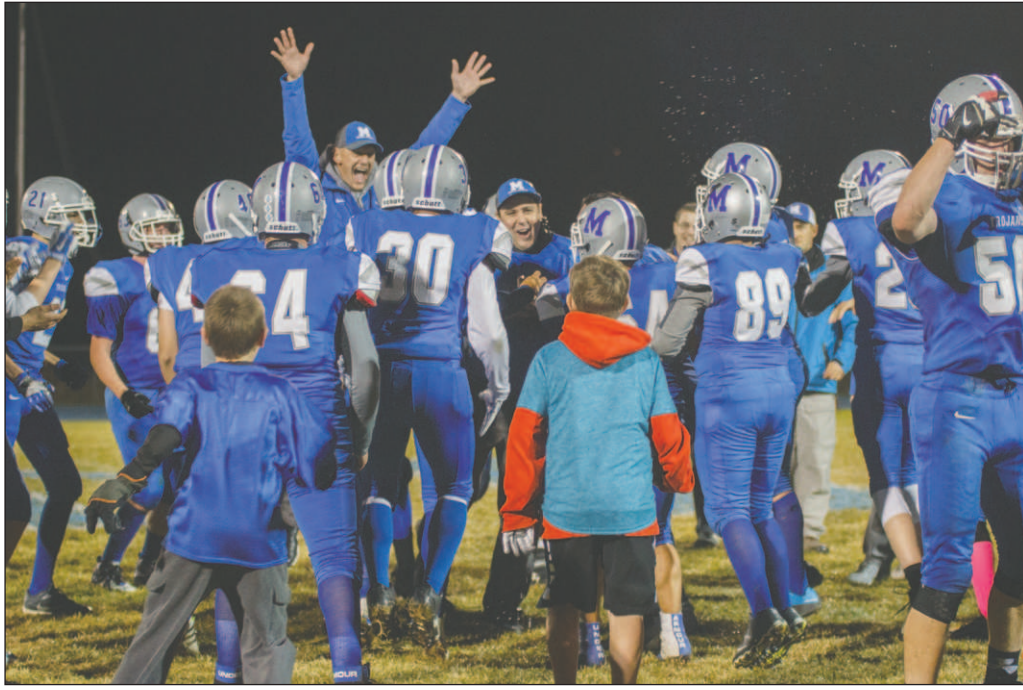
Manson Trojans players and coaches celebrate after taking the win against the Brewster Bears, leaving the Trojans placed first in league and heading into playoffs.

For Senior Night photos, see the Photo Gallery at www.lakechelanmirror.com