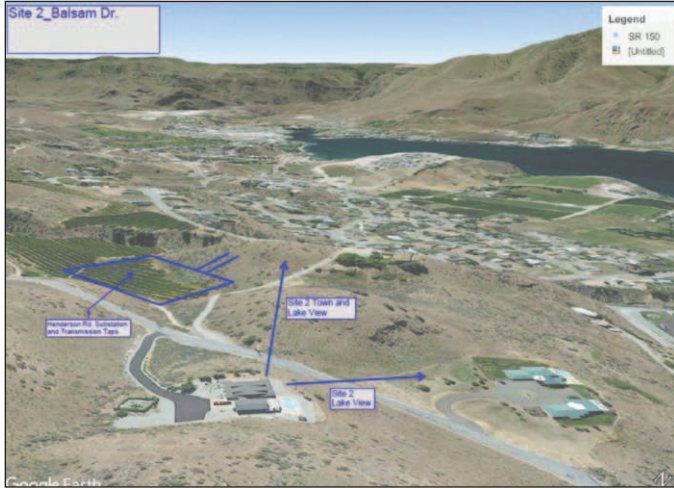
Graphic courtesy of Chelan County PUD

This technique would bring the lake view impact estimate from nine to four, and total view impact estimate from 94 to 74, due to the transmission lines being underground. The substation and two transmission tap lines would still be visible, however all existing overhead lines would stay as-is, and any new lines will be underground. The cost of underground transmission was not the only factor, there’s also operational considerations with underground transmission. Rice stated and explained the costs associ-