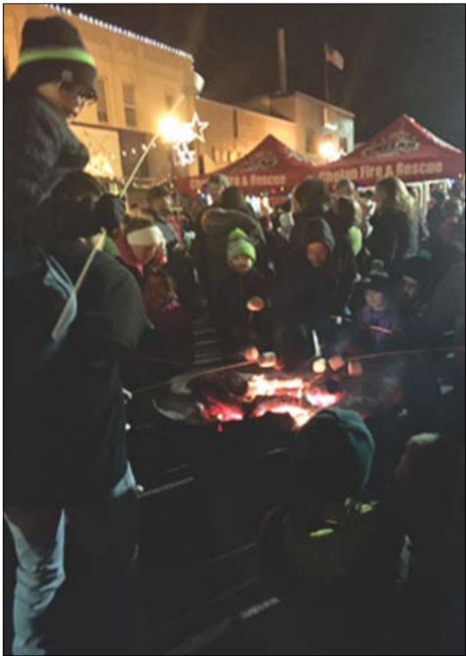
Historic Downtown Chelan Association (HDCA) kicked off Small Town Christmas with a children's light parade, tree lighting, a visit from Santa, and marshmallow roasting (above), Friday, Nov. 24 Historic Downtown Chelan. The Christmas tree (right) placed downtown Chelan was decorated and lit Friday, commencing the month-long Christmas festivities. Below: Santa greets the children on Woodin Avenue.