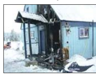
Damage was limited to the utility room and is considered re-buildable at a home in Union Valley that was damaged by fire on Dec. 16.