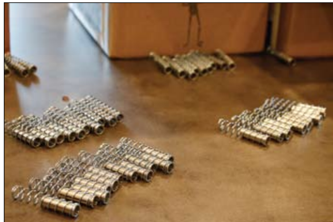
Lakeline LLC assembles and distributes pistol accessories such as varying sites, recoil accessories, grips and more.