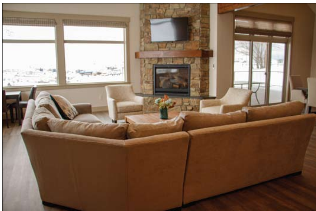
Ridgeview Place offers an abundance of comfort amenities, including an open floor plan, inviting living room, individual bedrooms with private bathrooms, guest rooms, and laundry and storage facilities on site.

After the holiday rush comes to pass, the search for in-home caregivers will