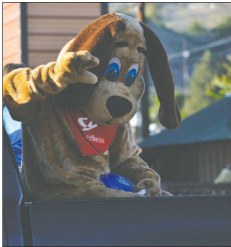
The Memorial Day Parade held in Chelan on May 24 had a little bit of everything: Bubbles being blown, a dancing horse, Cub Scouts, kids gathering candy and Max, LCCHC's "Club Max" kids' wellness program mascot. See more photos at www.lakechelanmirror.com