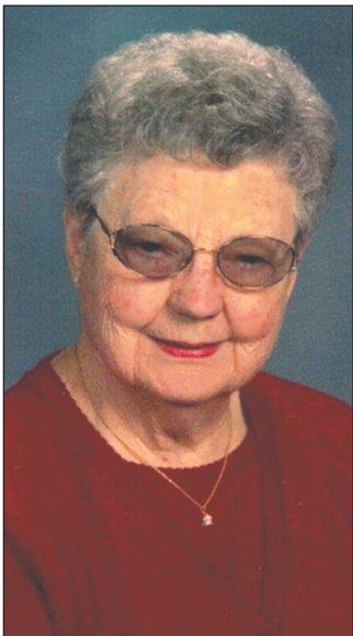
School's class of 1942.