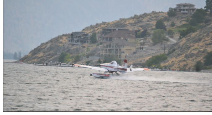
Fire Bosses, which hold up to 800 gallons in their pontoons, attacked the Chelan Hills fire on Friday evening, July 27, collecting the water from the lower end of Lake Chelan. Those recreating on the lake are encouraged to stay out of the way when they see planes and helicopters dipping water from any body of water. Drones are also asked to stay out of airspace around any fire. BELOW: The firefighter 'tent city' on the field behind The Community Gym in Chelan.

The first 24 hours are always critical, and the early morning rain on Saturday was of great help to this fire.