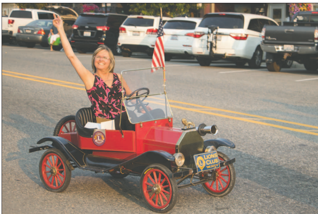
Lake Chelan Mirror File Photo