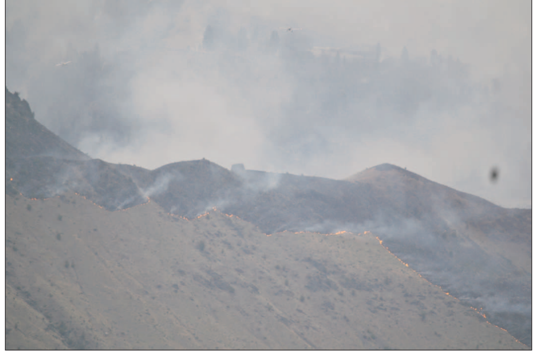
The Chelan Hills fire near Beebe Bridge is 1,842 acres in size and contained. This photo shows active fire on Friday evening, July 27. Crews have moved down to Entiat to help with the Cougar Creek Fire.