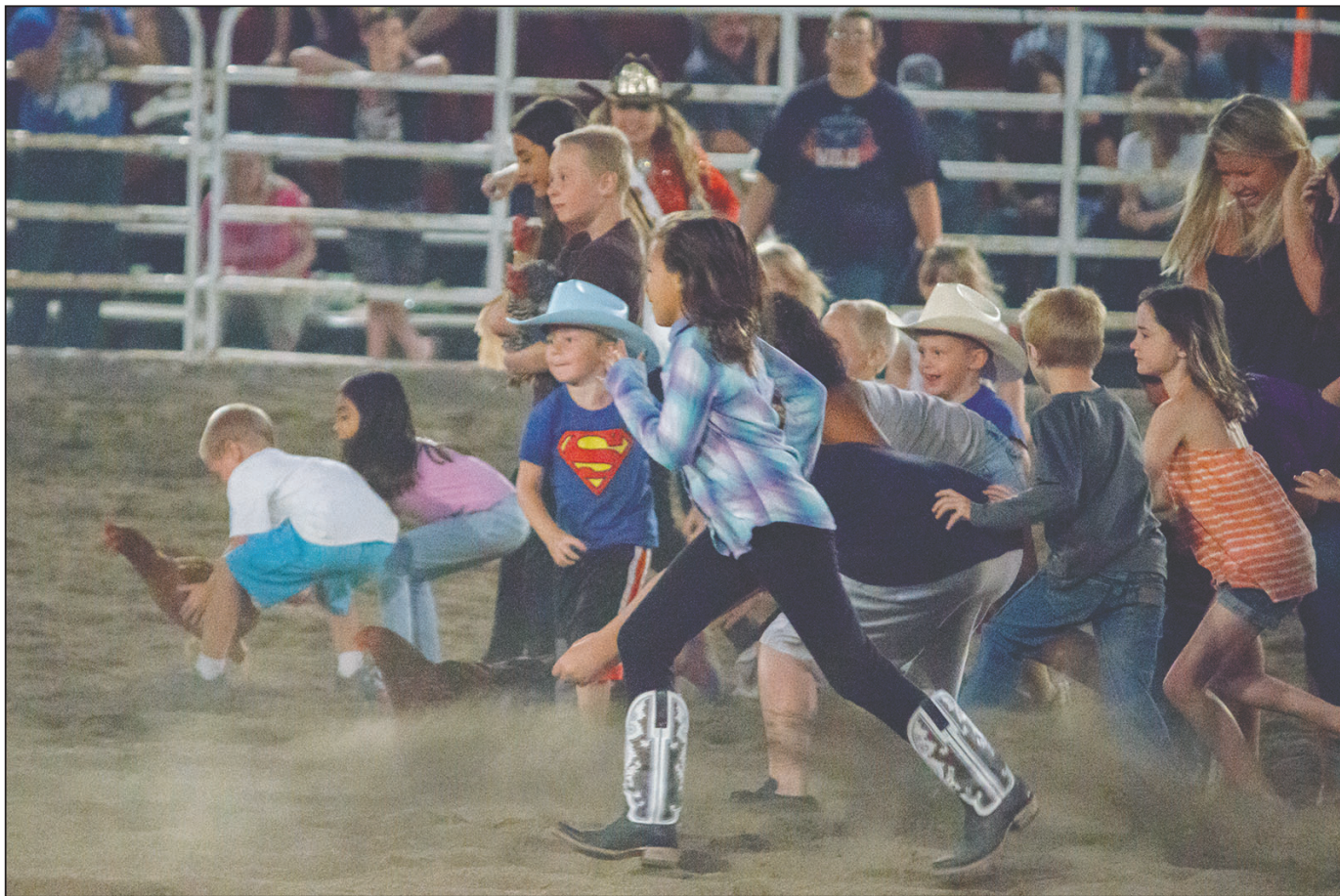
ABOVE: Chickens and children ran amuck during the "World Famous" Chicken Race.

The rodeo kicks off at 7:30 p.m. with the Grand Entry of visiting royalty, the Shadow