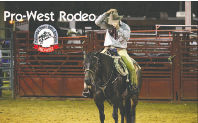
Sanctioned by ICA, Pro-West, WBRA