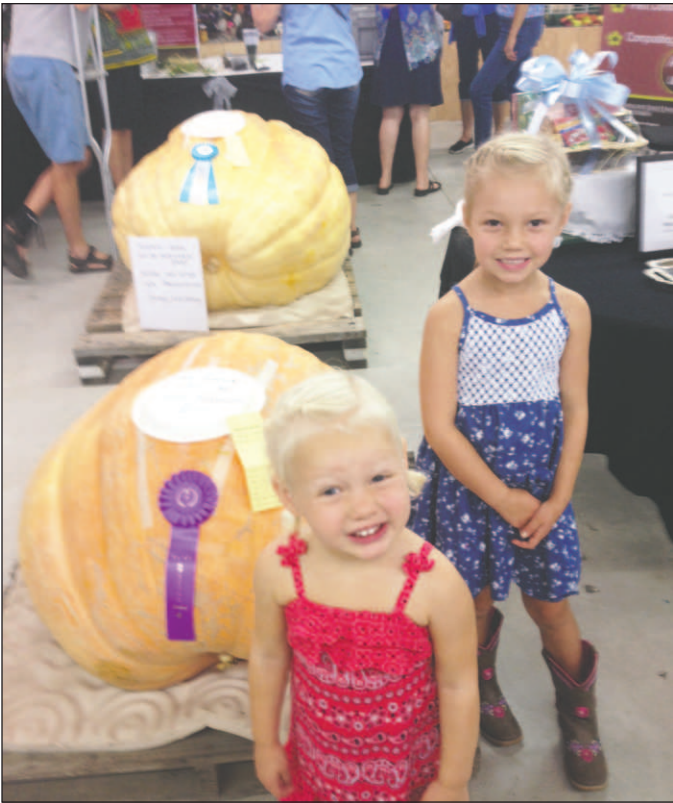
Prize-winning pumpkins meet country bumpkins, here at the Fair!