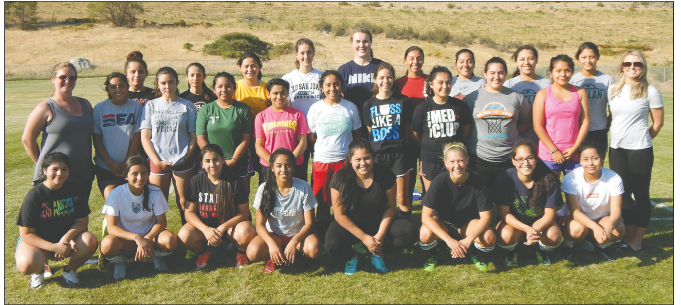
2018 Chelan High School Soccer team.

The girls soccer team had their first home game at Mountain Goat Field on Saturday against Wahluke, winning 4-2.