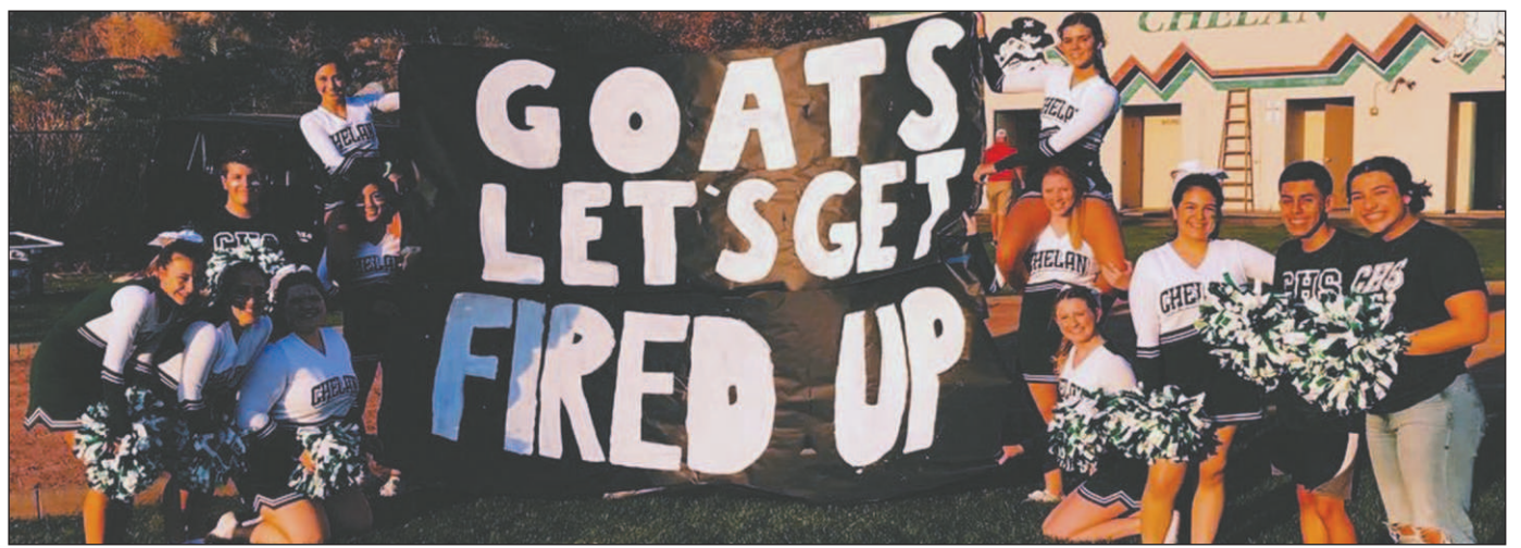
2018 Chelan High School Cheer Squad.

“The returning cheerleaders have been very welcoming to the new cheerleaders. The new squad members are eager to learn cheers and dances, and have such a strong work ethic it makes things run very smoothly between squad members and the learning period at the start of the season,” coach