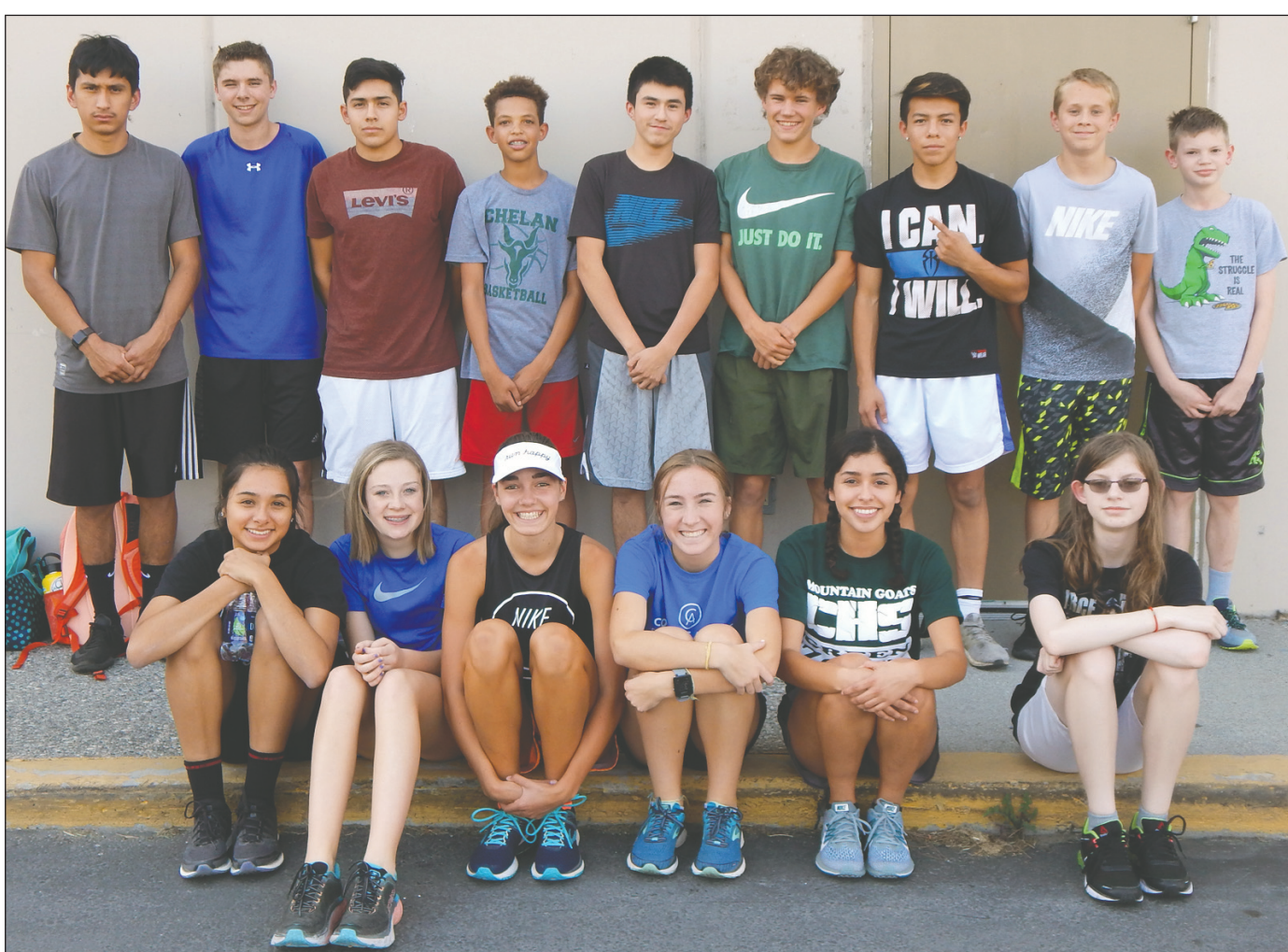
2018 Chelan High School X-C Team.

The Goat’s first Cross Country home meet will be held on Oct. 2 at the Chelan State Park.