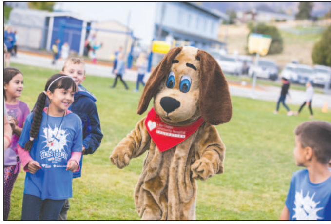
Max, LCCHC wellness program mascot will celebrate his 5th birthday at the free Family Fun Run 5k on Saturday, Sept. 15 at 9 a.m., at Wapato Point in Manson.