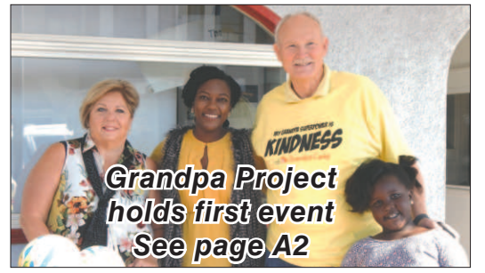
Grandpa Project holds first event See page A2