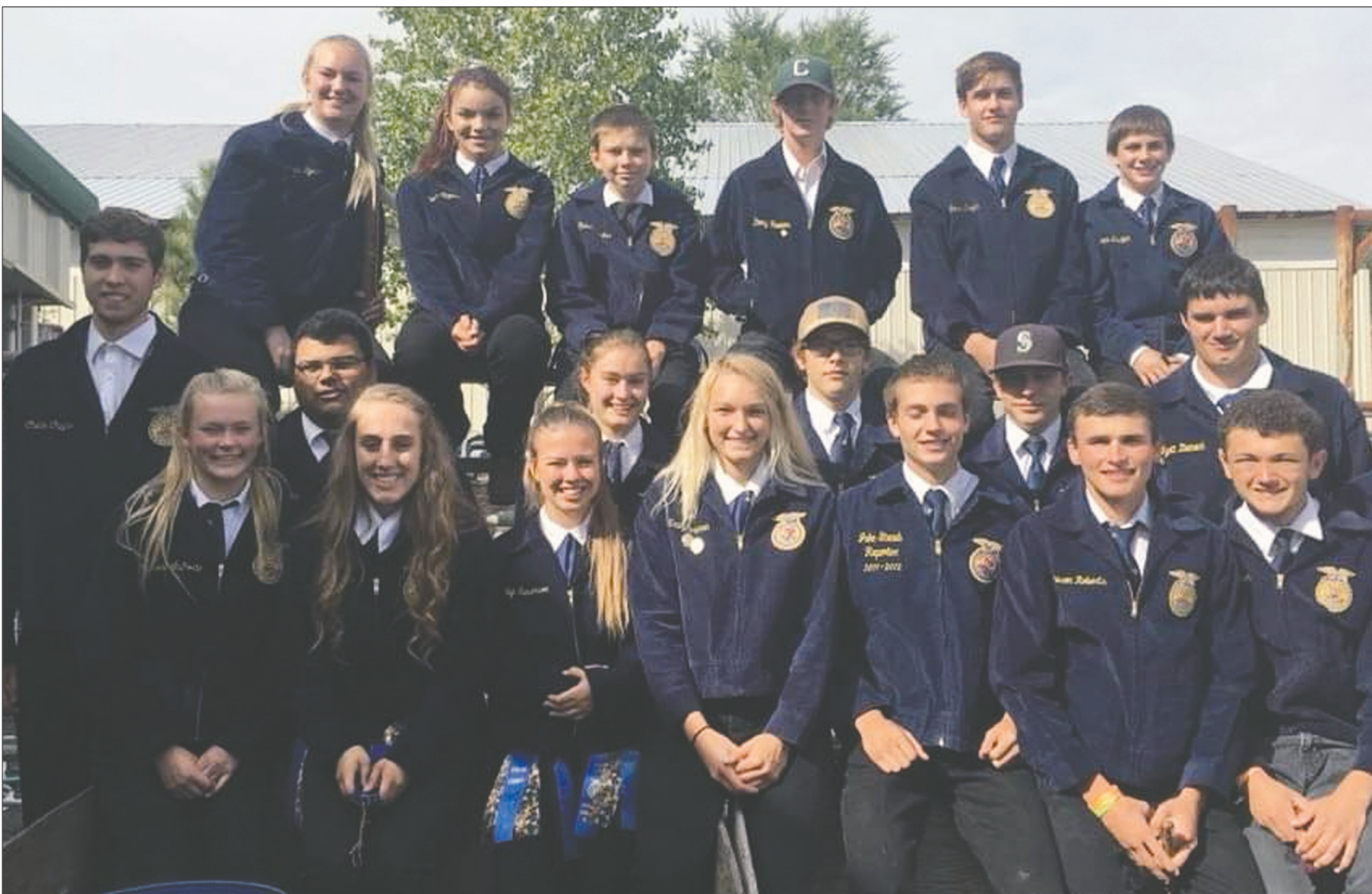
Chelan School District Future Farmers of America (FFA) 2018-2019 members.

In mid-August, the kids start preparing for upcoming fairs, they shear goats and get their personal bios and educational posters to pres-