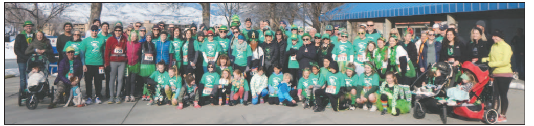
The Lake Chelan Lions Club sponsored the second Shamrock Shuffle 5k Fun Run, that took place on March 16, at Riverwalk Park. This fun run is for Diabetes Awareness and raises funds to send local students with Diabetes to a Lions Club sponsored camp in Spokane. This year, the numbers were a little down compared to last year, however the cold temperatures didn't stop 111 participants, from babies to grownups, from completing the course.