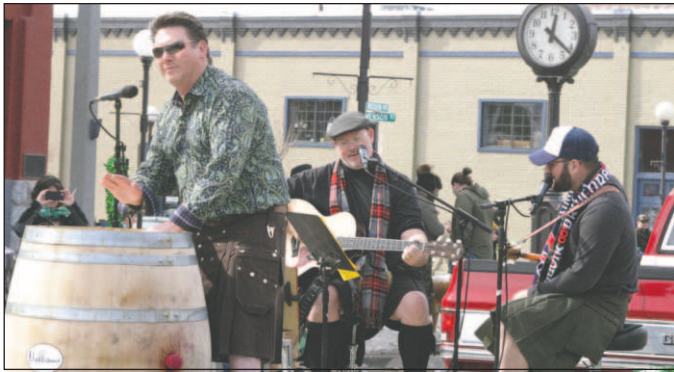
A three man band sang a few melodies and cracked a joke here and there.