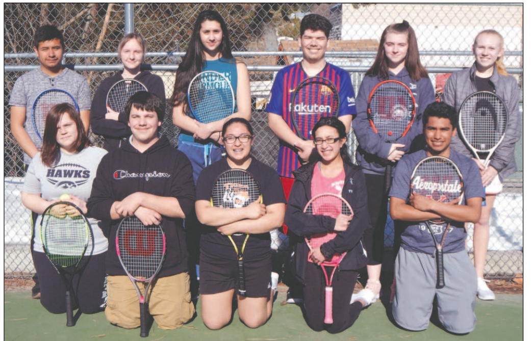
The 2018-2019 Entiat tennis team.

Last Friday, March 15 the Tigers faced Omak and according to the coaches the team did alright for not being on the court too often yet. The next match for the tennis team will be at home on Thursday, March 21 against Tonasket.