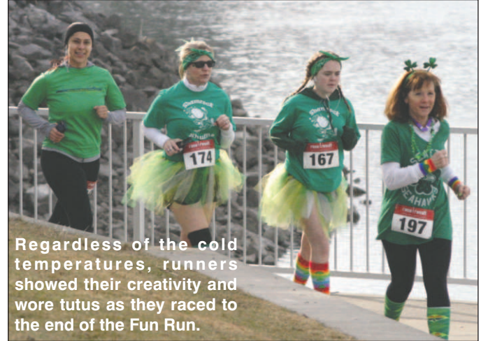
Regardless of the cold temperatures, runners showed their creativity and wore tutus as they raced to the end of the Fun Run.