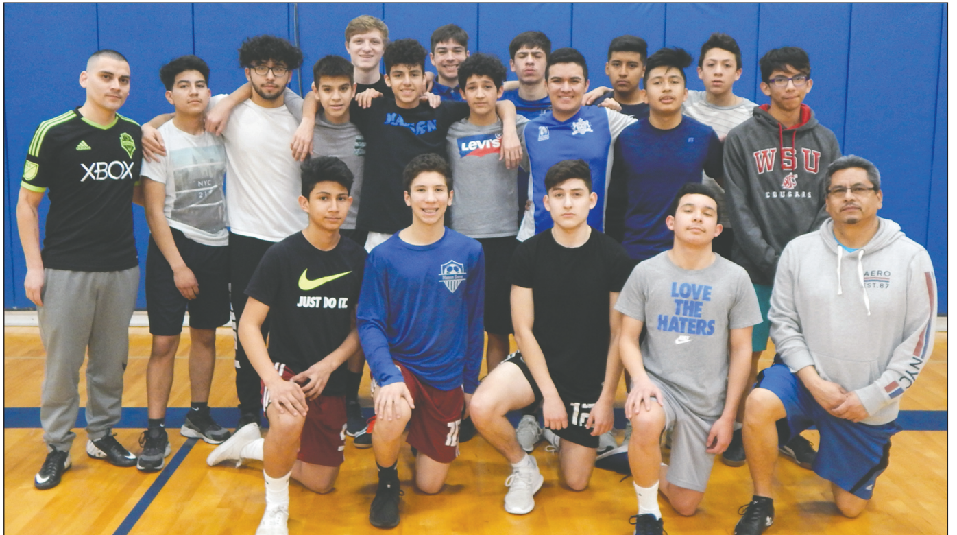
The 2018-2019 Manson High School boys' soccer team and coaching staff.

The team has great unity outside and inside of the field, they communicate well and push each other. On Thursday, March 21 the Trojans will get a chance to debut in front of the home crowd against Brewster, if weather permits.