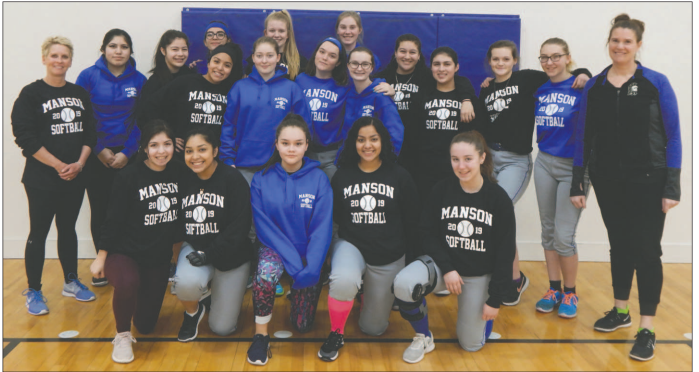
The 2018-2019 Manson High School softball team and coaching staff.

A lot of the softball games have already been rescheduled for the Lady Trojans due to the weather. At the moment it looks like the team will be playing a double-header against Oroville in Manson, however it all depends on the field conditions.