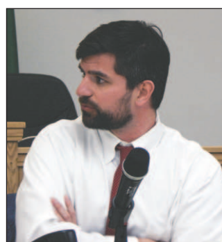
City Attorney Quentin Batjar

Once the property is purchased the property would be assigned to the Port, then they would administer the property and do their storage business. The payoff made whole to the Port would be taken from the revenue created of the three acre property. Total payback of the property should be by Jan 1, 2035 or sooner with 2.5 rate