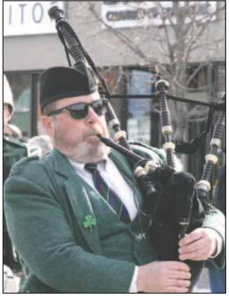
It would not be an Irish celebration without the notes from the Uilleann pipes.