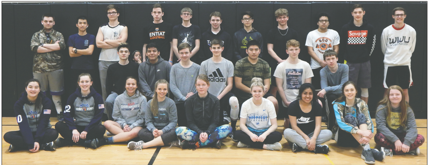
The 2018-2019 Entiat High School track and field team.

The boys' team is well rounded, the Tigers have, "good distance runners, good sprinters, good throwers, good jumpers." The Lady