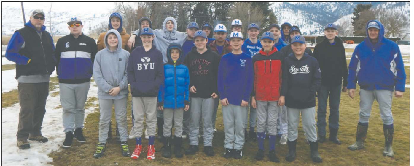
The 2018-2019 Manson High School baseball team and coaching staff.

The 2019 schedule can be found on CWBathletics.com. Updates and game write-ups can be found on the team's Facebook under Manson Trojan Baseball.