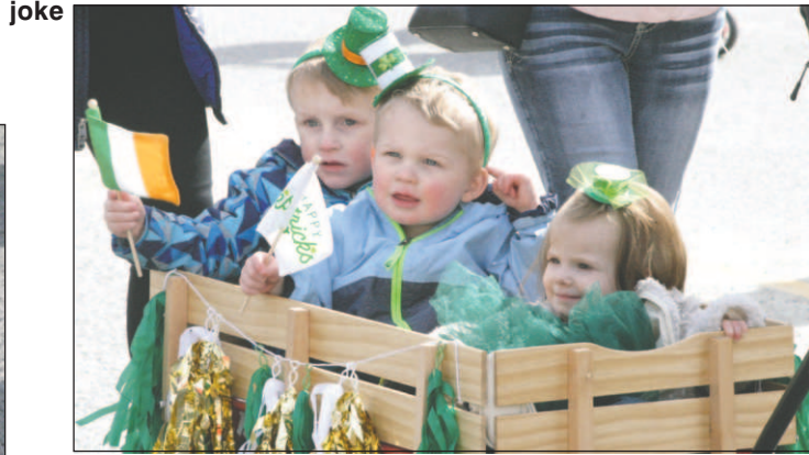
It is never too early to parade Downtown Chelan, it is even better if you don't have to walk.