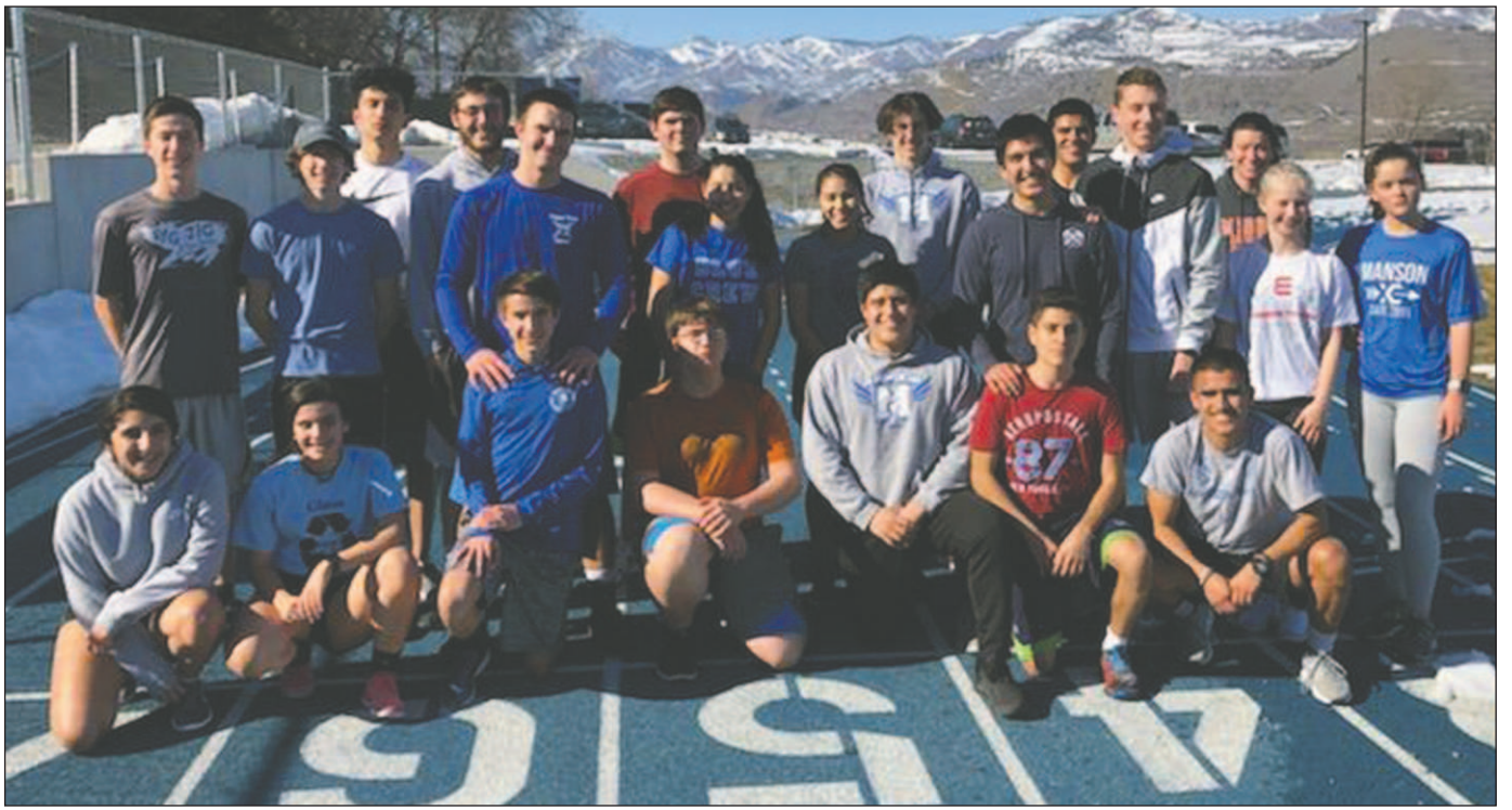
The 2018-2019 Manson High School track team.