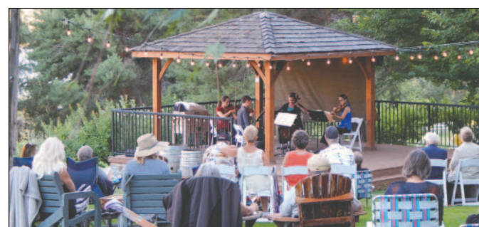
ABOVE: The String Quarter's first performance of the festival for Lake Chelan Bach Fest. BELOW: Every angle was the right one to sit and listen to the String Quartet.

CHELAN - Rio Vista Winery, 9 miles north Chelan, hosted the very first Music on the Vine concert, part of the Lake Chelan Bach Fest. Rio Vista was able to accommodate 120 or so people in lawn chairs as the String Quartet delighted all with its music, which began at 7:30 p.m. Attendees were able to bring