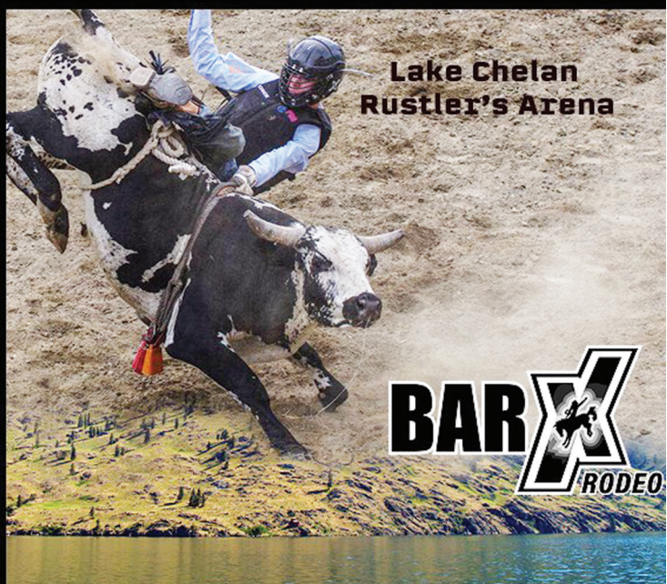
Lake Chelan Rustler's Arena