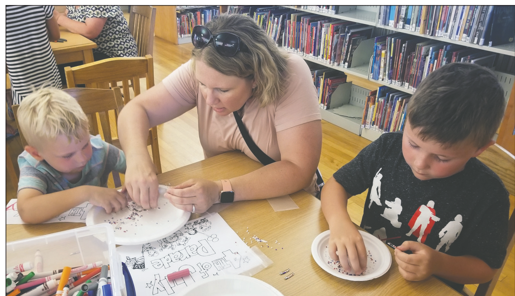
The kids' crafting day was ideal for parents and children to hang out and have fun. For more events at local libraries go to: ncril.org. More photos at lakechelanmirror.com

The Burke Museum was founded in 1885 and is the oldest public museum in Washington state. More than 35,000 students visit the museum in Seattle every year, and another 70,000 children as reached through its traveling educational exhibits.