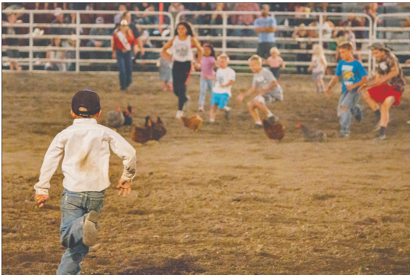
ABOVE: Chickens and children run amuck during the "World Famous Chicken Race".

It's Rodeo Time, in the Lake Chelan Valley