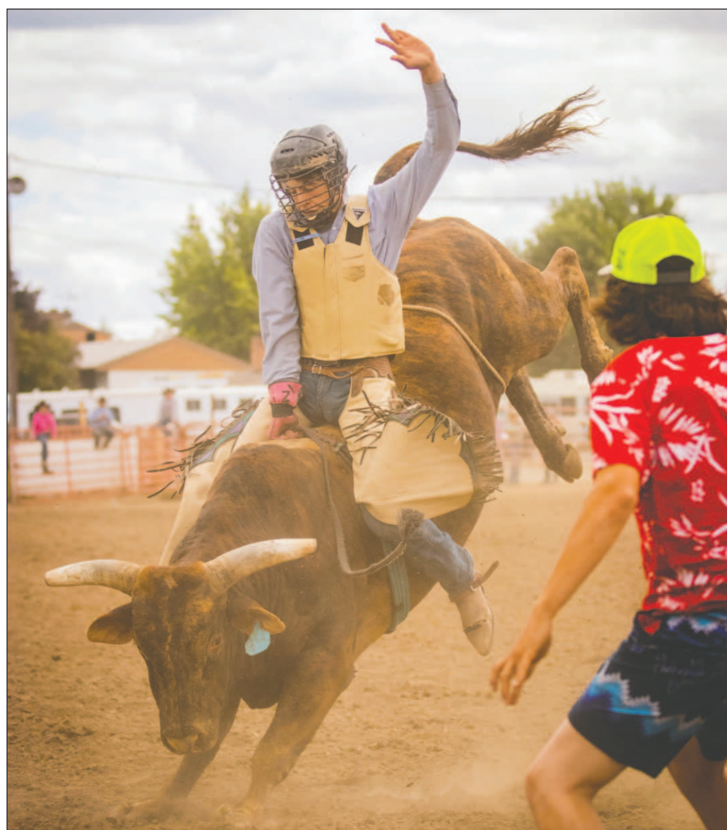
With stock from Bar X Rodeo Company this year's rodeo will have bull riding, saddle bronc riding, tie down roping, barrel racing, breakaway roping, steer wrestling and team roping.