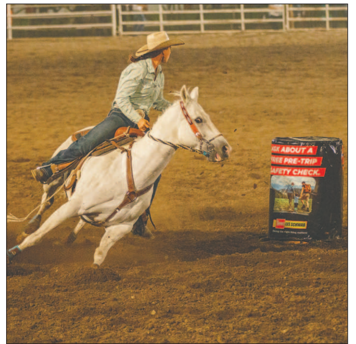
Saturday morning, July 27

Saturday morning kicks off with a 65 year tradition of the "Cowboy Breakfast" before the timed event slack performance from 7 a.m. to 10 a.m. The cooks from the Chelan FFA will be turning out pancakes, eggs, sausage, biscuits and gravy or breakfast sandwiches.