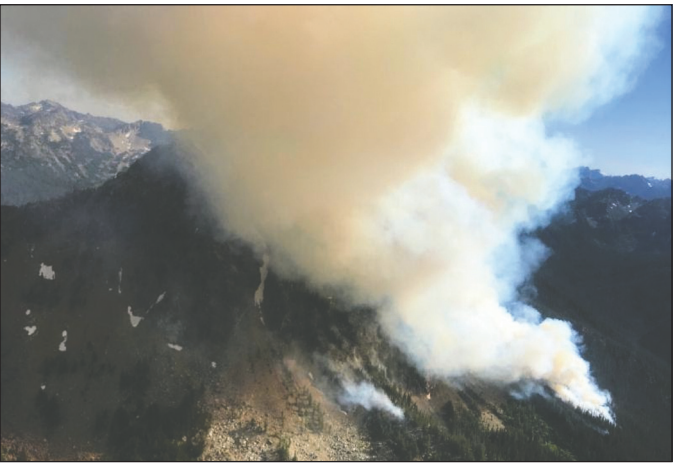
The Devore Creek Fire burns in extreme terrain entirely within the Glacier Peak Wilderness three air miles from the community of Stehekin, Wash. on July 26, 2019.

On Monday (July 29) winds are expected to be light to moderate and will likely push any new fire growth to the east towards Castle Rock. Ground crews will continue to improve the protection line. Due to the extreme terrain, firefighter safety, and lack of roads or other natural holding features, some portions of this fire will likely continue to grow in the fire-adapted landscape of the North