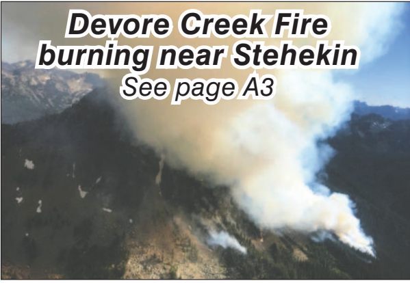
Devore Creek Fire burning near Stehekin See page A3