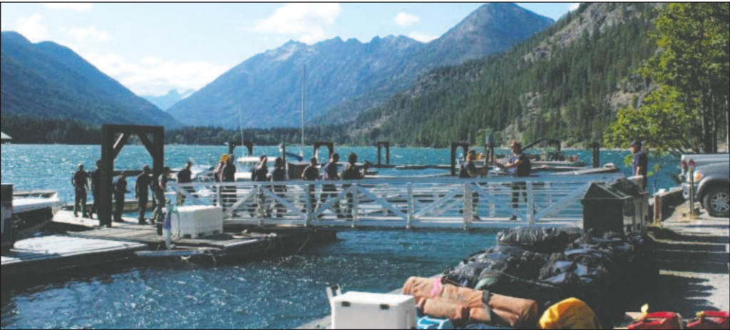
The Entiat Hotshots arrive via boat in the remote community of Stehekin, Washington to support the Devore Creek Fire on the Okanogan-Wenatchee National Forest on July 27, 2019.