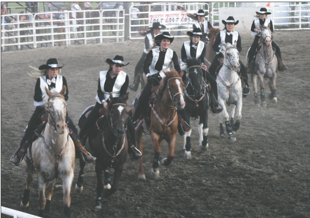
FROM THE TOP: The boy on the right could possibly be talking his friend into sharing his cash prize after catching the chicken during the World Famous Chicken Race. Chariot races were new this year, lots of action went on. The Tillicum Riders of Cashmere showed off their horseback riding skills. How many people does it take to wrestle a steer? Too many.