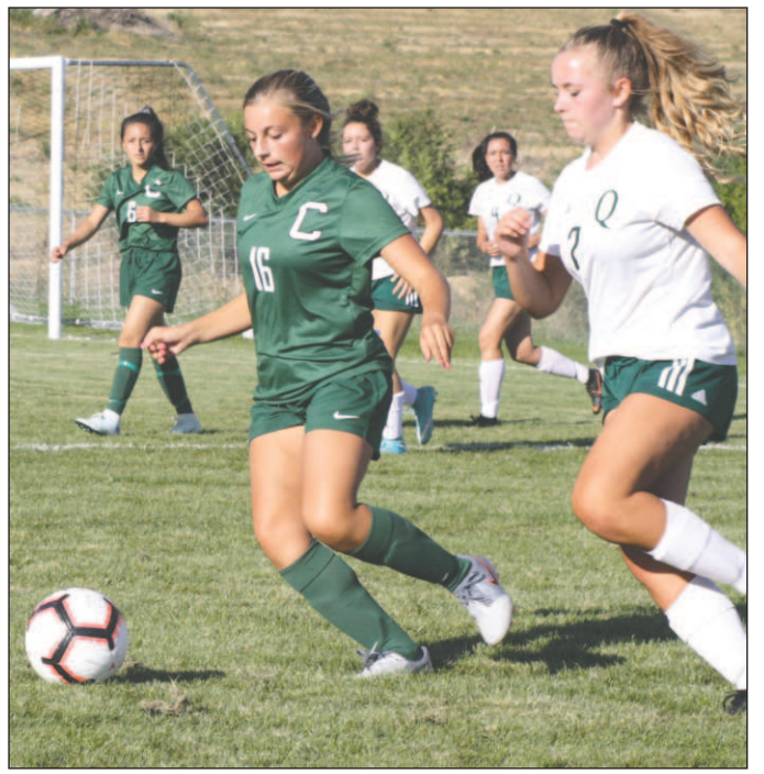
The girls played Quincy at home on Sept. 12 and lost 3-1. They tied in their first game at Liberty Bell 2-2.