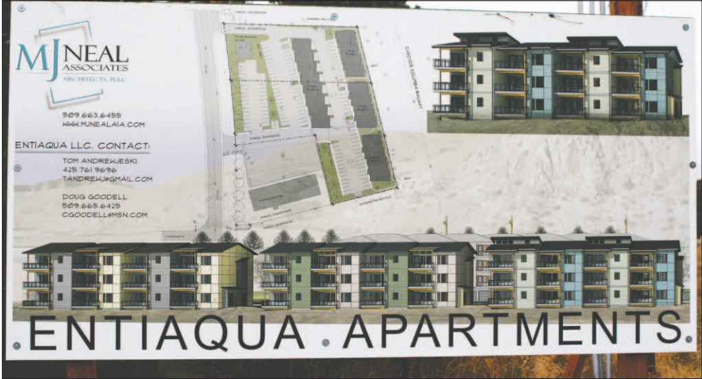
BELOW: The banner at the building site shows the public a finished view.

acres of riverfront land for $340,000 and are investing $1.8 million to construct phase 1 of what they hope