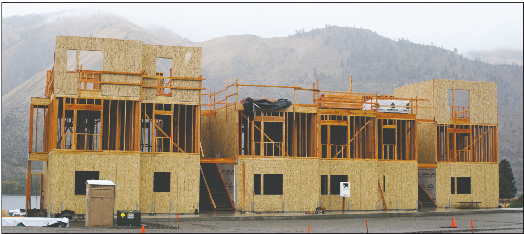
ABOVE: This framed building will eventually be home to the 12-unit Entiaqua Apartments, ready for occupancy June 2020.