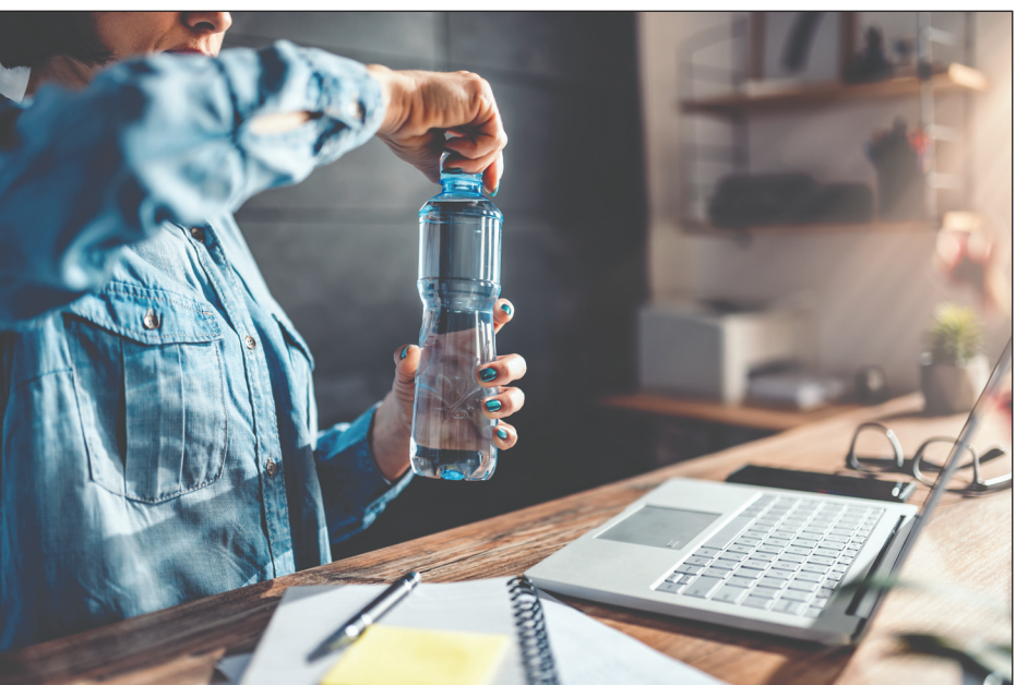
Drinking plenty of water can help prevent dehydration. Not sure how much to drink? Many medical professionals suggest following the 8x8 rule, eight ounces of water eight times a day.

great time to try that new recipe or food subscription box! • Stay Hydrated: Drinking plenty of water can help prevent dehydration. According to the Centers for Disease Control and Prevention, dehydration can cause unclear thinking and mood swings. Not sure how much to drink? Many medical professionals suggest following the 8x8 rule, eight ounces of water eight times a day. • Stay Connected: Just because you can't be with friends and family in person doesn't mean you can't stay in touch. Set up time to connect with video chats, phone calls and emails. Staying connected doesn't have to be high-tech. Have kids or just a kid at heart? Write encouraging messages on your driveway or in your windows for your neighbors, and postal and delivery workers. • Know Your Options: One of the best ways to prepare is knowing what to do if you start to show symptoms. Cigna and many other health insurers are now waiving the costs of doctor visits related to a COVID-19 diagnosis as well as the cost of COVID-19 FDA-approved testing. To minimize your exposure, call or email your doctor or a local health system about a telehealth visit to be screened for COVID-19. The provider will then identify what steps you should take next. • Get Support: Talking through concerns and fears can help put them in perspective and make you feel calmer. You may want to reach out for professional support if you're struggling. Cigna offers many resources and tools, including a 24-hour