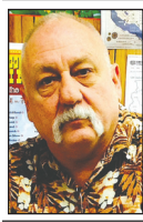
APPLES TO APPLES Gary Bégin

Why should those taxpayers with children younger than 5-years-old be forced to do the same? I would propose a "pay to play" program wherein each family is taxed by the school district they live in based on the children actually in public school and only if they are in a public school.