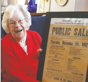
1912 Parents' Sale of Oklahoma Farm