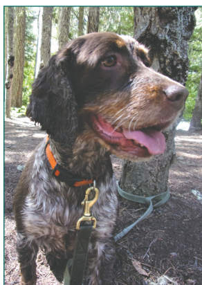
Are you looking to enjoy a day on the trail with your dog too? Here's some helpful advice:

With the sun higher in the sky we headed back to the trailhead, reaching the comfort of our air-conditioned truck before noon. On the way home we did our traditional stop at McDonalds where Georgia was rewarded for good behavior with a small plain hamburger; her favorite.