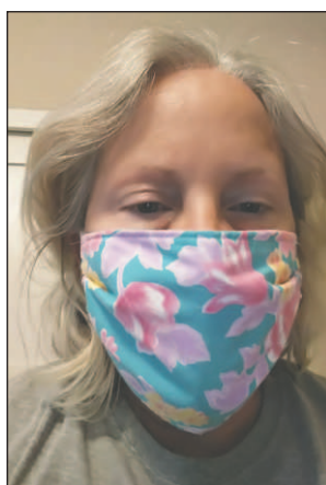
SUBMITTED BY CITY OF CHELAN

CHELAN - The City of Chelan has announced the