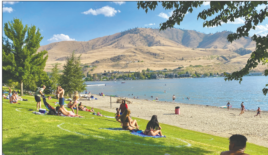
Social Distancing Circles at Don Morse Park.

CHELAN - Overcrowding at Chelan's beautiful Don Morse Park and Lakeside Park is nothing new. The parks have a long history of drawing visitors from across the state and beyond, and