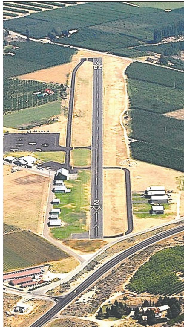
Lake Chelan Airport

The Lake Chelan Airport is owned and administrated by the city of Chelan and the Chelan-Douglas Port District.