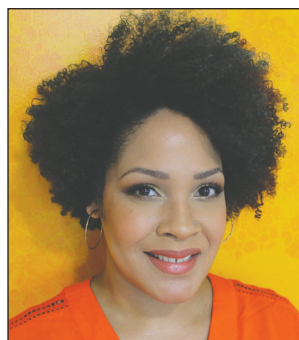
Ijeoma Oluo

"The book guides readers of all races through subjects ranging from in-