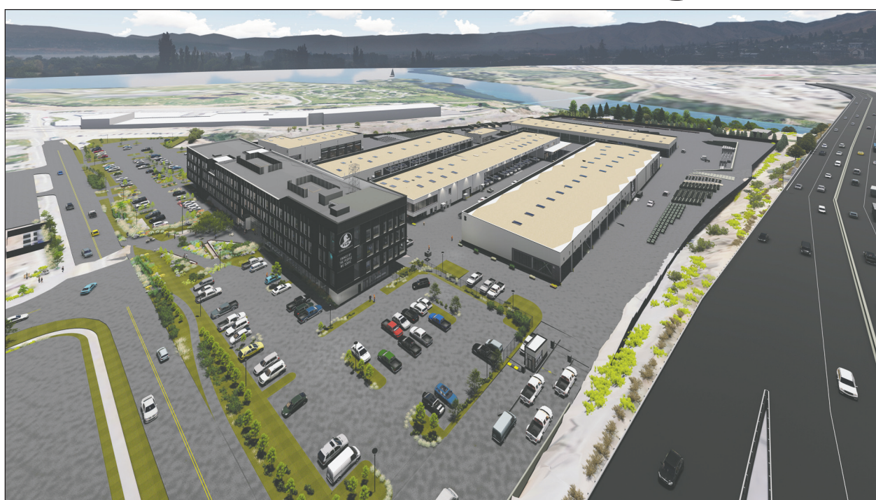
Artist rendering courtesy Chelan County PUD

Heard the results of a 2020 customer satisfaction survey, indicating 86% of customers are satisfied or very satisfied overall with the PUD with particularly strong scores for service reliability and quality of communications (0:07)