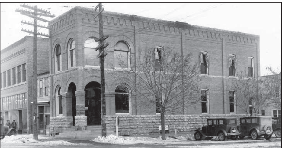
The Miners & Merchants Bank, which was established in 1902, operated until 1955, when it was acquired by SeaFirst. The building was built in 1907.

Annual Memberships: Individual $25, Senior $20 (age 60 and above), Family $40, Patron $100, Business $100. Send your check to: Lake Chelan Historical Society, P.O. Box 1948, Chelan WA 98816-1948.