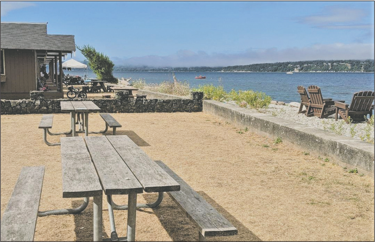
ABOVE: The waterfront cabins overlooking Saratoga Passage at Cama Beach Resort.

A drive through the park takes you downhill to the day use area at Lowell Point. Here you'll find a busy boat launch and dock, covered picnic shelter and a number of picnic tables sitting above the high tide mark of the rocky beach. With 6700 feet of shoreline there is plenty of room to spread out along the beach. Many spend the day watching yachts and pleasure boats pass through Saratoga Passage, and sometimes a seal or orca whale will surface as well. Others launch kayaks or power boats and most of latter have crab pots. The crabbing here can be very good. Red rock crabs are