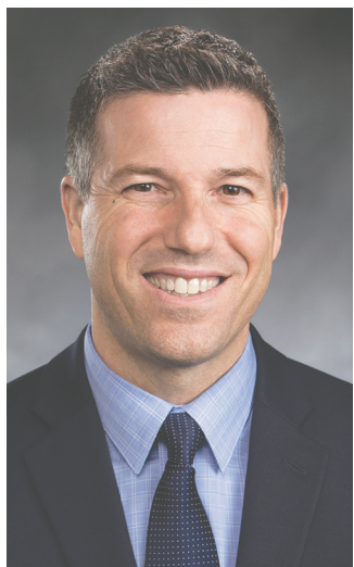
Sen. Brad Hawkins

Meetings with Hawkins during this year’s virtual tour will take place through Zoom video conferencing or tradi-