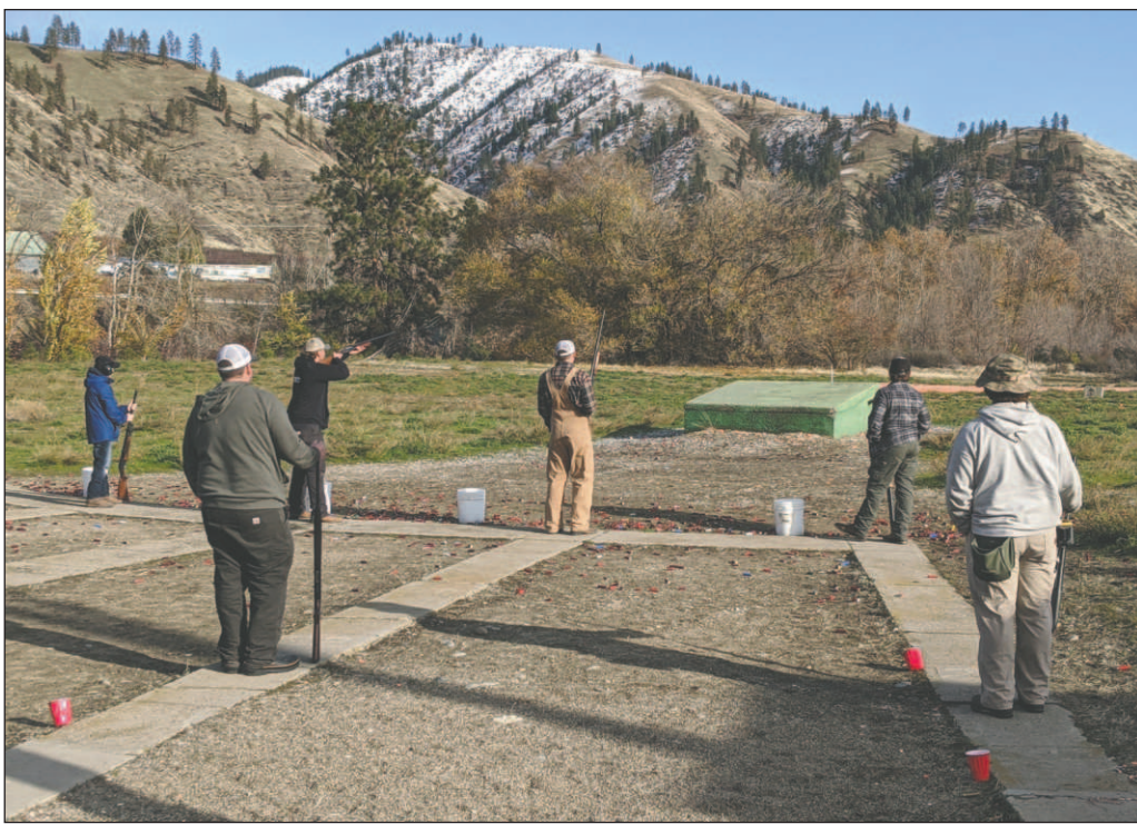
Shooting trap at the Cashmere Sportsmen's Association Range during the annual November Turkey Shoot.

Trap is a deceptively simple game. A squad of up to five shooters occupy five different designated stations located 16