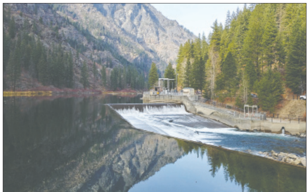
Two maintenance projects to the fishway at Tumwater Dam will require intermittent, one-lane closures of eastbound Highway 2 starting in late November and an 8-hour, one-lane closure of eastbound Highway 2 in mid-December, depending on weather conditions and river flows.