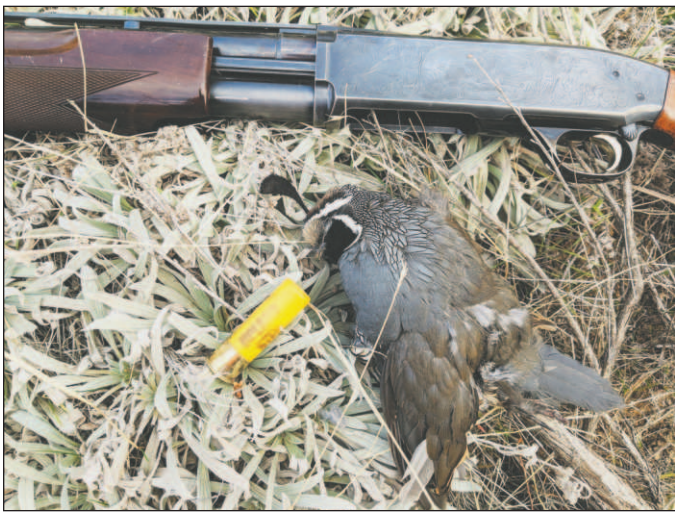
A valley quail taken at the Chelan Butte Wildlife Area.