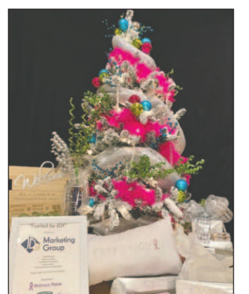
LEFT TO RIGHT: "Peppermint Dreams" - 12 Tribes Resort Casino knows that their senior community at Apple Springs Convalescent Center in Omak, misses playing their favorite casino games. "Angels Among Us" - Country Financial will deliver the Trees4JOY package to Confluence Health. "Fueled by JOY" - JBe Marketing Group, LLC. selected Wellness Place, a place where they give free resources to individuals, their families and caregivers through their cancer journey.