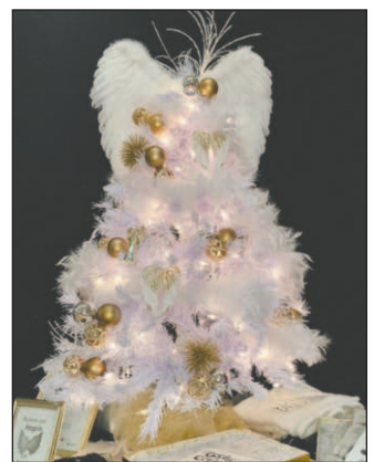
Colville Convalescent Center, Nespelem • 12 Tribes Colville Casino, "Peppermint Dreams" - Apple