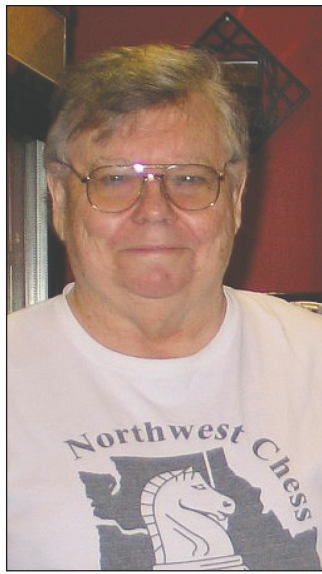
Chelan High School in 1960. He earned an Associates de-