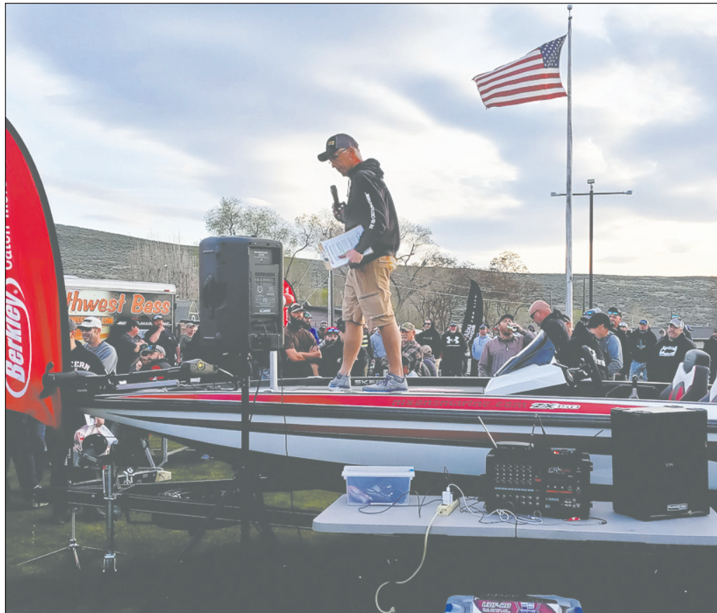
Willie Nelson with Northwest Bass and Nixon's Marine explaining the rules at a meeting the night before the tournament.

The biggest hourly winning bass weighed in Saturday was