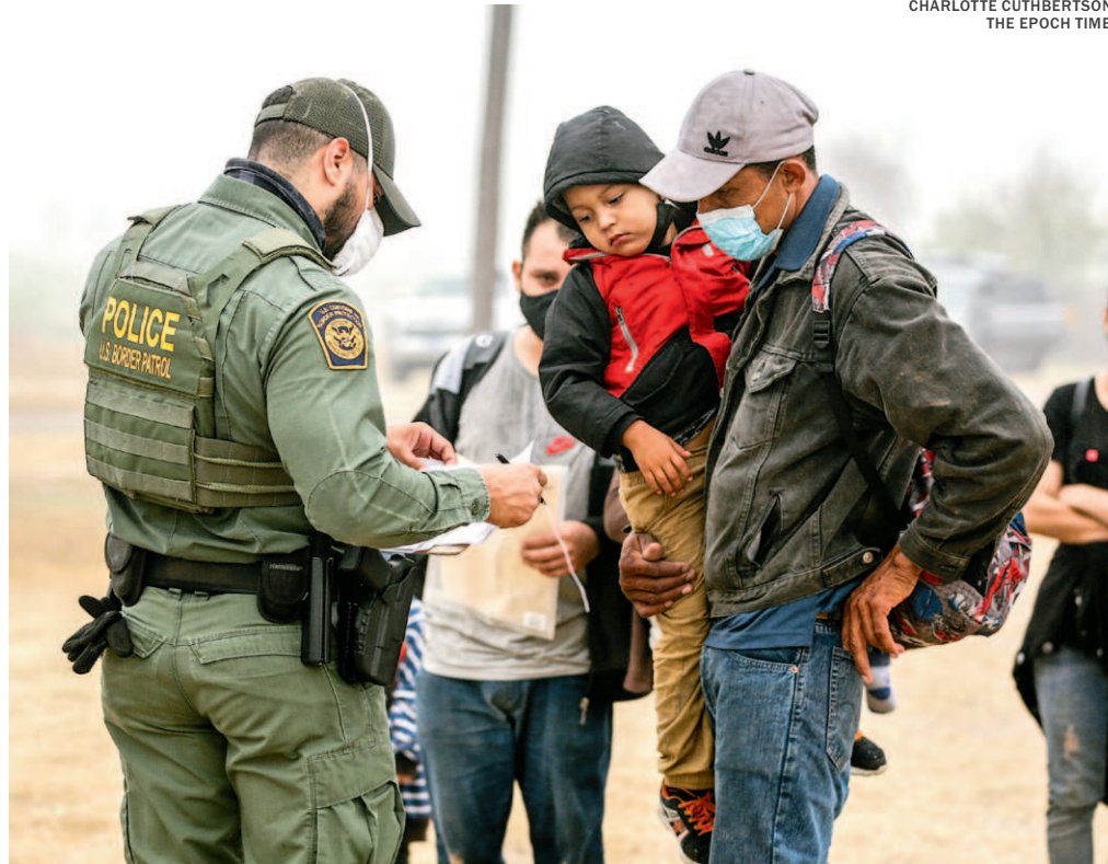
A group of illegal immigrants with Border Patrol after crossing the U.S.-Mexico border in La Joya, Texas, on April 10, 2021.

Of the 178,000 illegal border crossers encountered