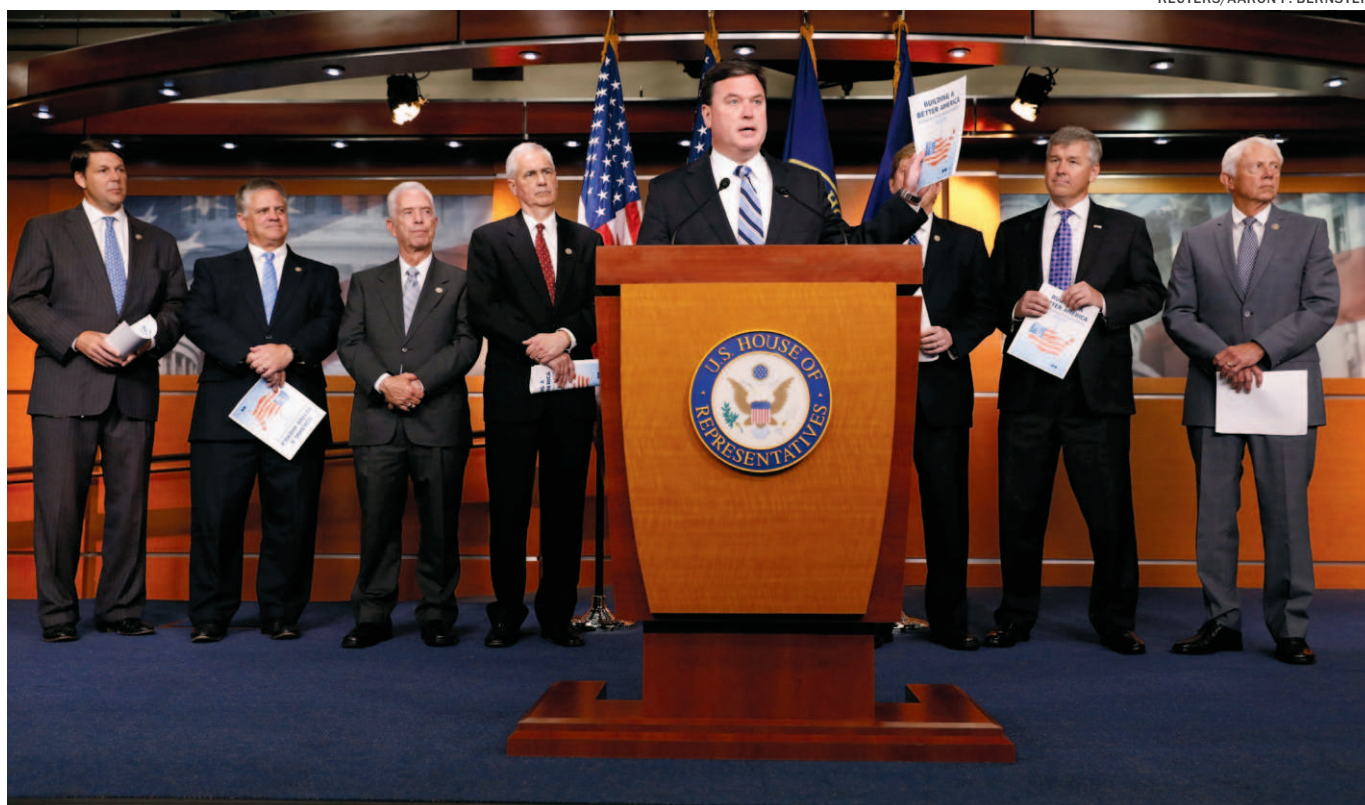
Then-Rep. Todd Rokita (R-Ind.) (C) speaks at a press conference on Capitol Hill in Washington on July 18, 2017.

"CRT is an ideological construct that analyzes and interprets American history and government primarily through the narrow prism of race. Similarly, the 1619 Project seeks to 'reframe the country's history'