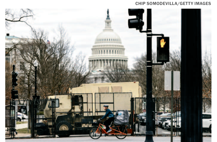
An 8-foot-tall security fence topped with concertina razor wire surrounds the U.S. Capitol in Washington, on March 16, 2021.

The bill would reimburse the National Guard for costs incurred when troops were deployed to the Capitol earlier this year, provide Capitol Police with overtime pay, and other resources. The bill would also create a response force that would aid Capitol Police during a crisis, as well as fortify doors and win-