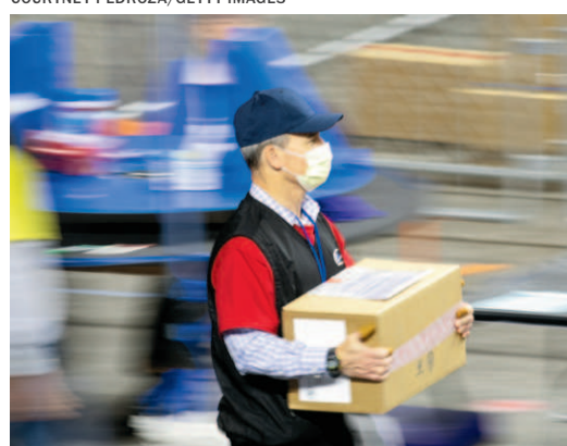
A contractor transports ballots from the 2020 general election, at the Veterans Memorial Coliseum in Phoenix on May 1, 2021.

Arizona senators have said they’ll use the findings from the audit to inform future election integrity bills. The Arizona Senate ordered the audit in December 2020, citing public concerns about how the 2020 election was run.