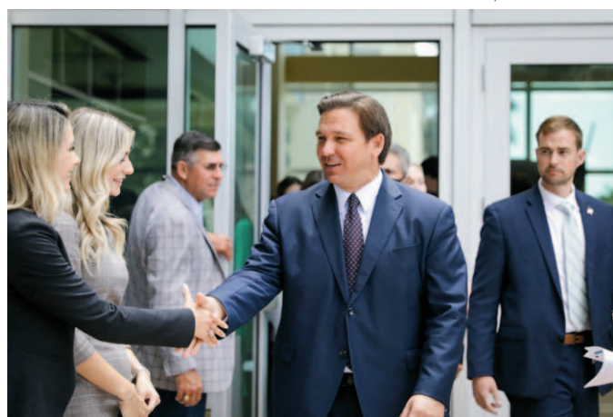
Florida Gov. Ron DeSantis departs after signing into law Senate Bill 7072 at Florida International University in Miami, Fla., on May 24, 2021.

ians who violated local government orders follows an executive order issued by the governor on May 3 that suspends all local pandemic emergency mandates effective July 1.