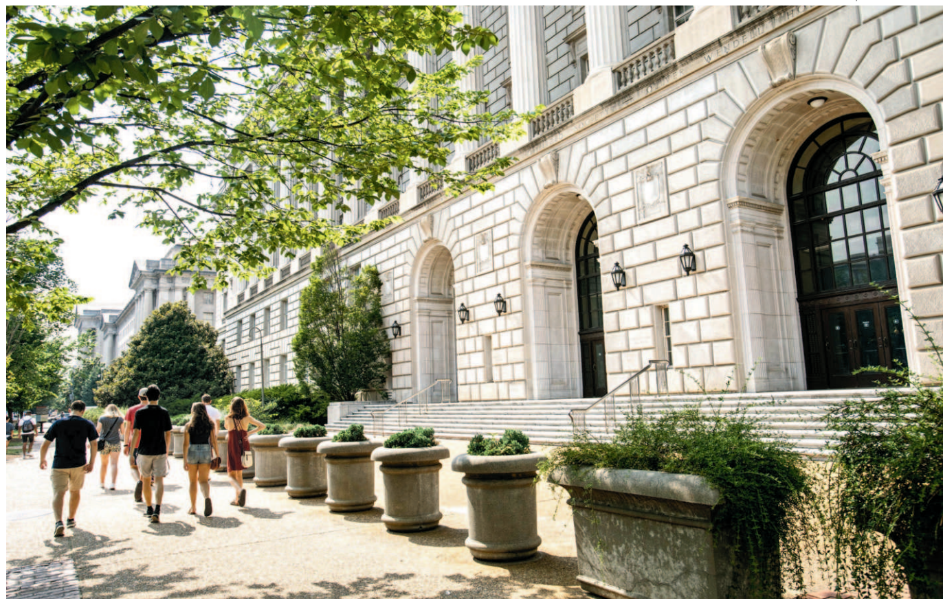
IRS headquarters in Washington on June 17, 2018.

Christians on what the Bible says in areas where they can be instrumental, including the areas of sanctity of life, the definition of marriage, biblical justice, freedom of speech, defense, and borders and immigration, U.S. and Israel relations,” he wrote.