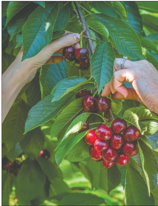
Cherry growers are optimistic that they will have a good harvest despite the unseasonably hot weather.

Besides bleeding tar, hot cars are risky for pets and