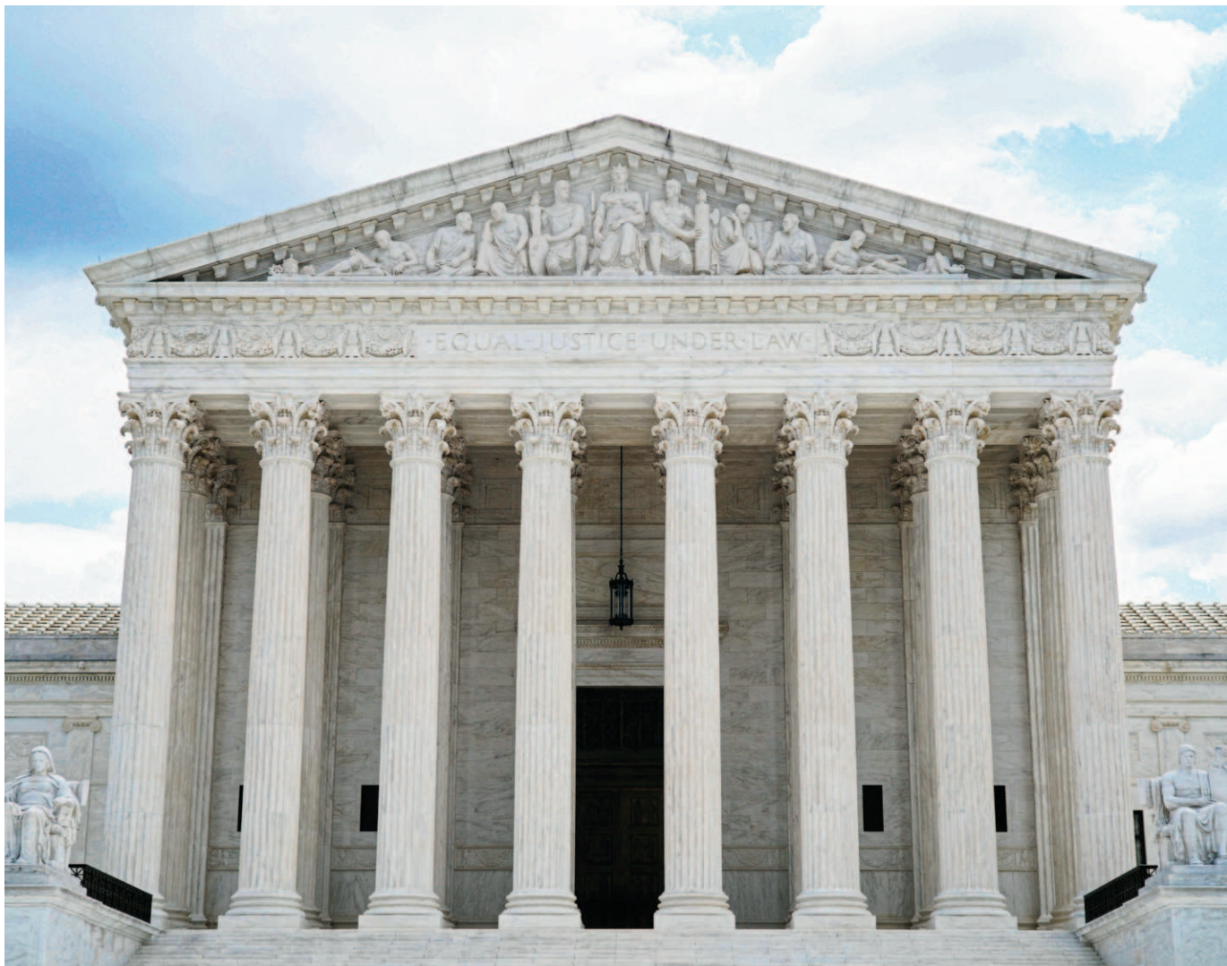
The Supreme Court in Washington on July 1, 2021.

and African American voters in Arizona, in violation of the 'results test' of Section 2 of the VRA."