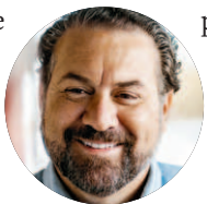
Arizona Attorney General Mark Brnovich.