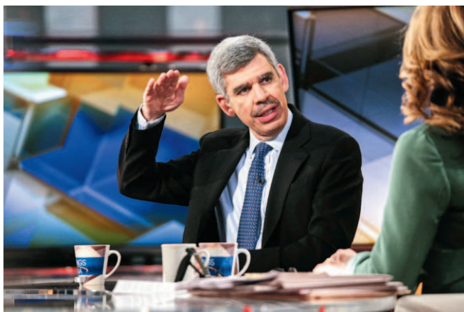
Mohamed El-Erian, chief economic adviser of Allianz, appears on the Fox Business Network at Fox Studios in New York on April 29, 2016.