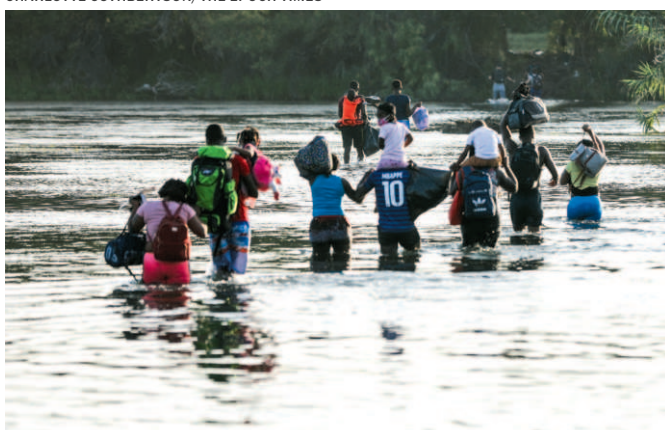
A group of illegal immigrants crosses the Rio Grande from Acuna, Mexico, to Del Rio, Texas, on July 25, 2021.