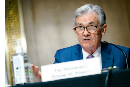
Federal Reserve Chairman Jerome Powell testifies on Capitol Hill in Washington on Dec. 1, 2020.