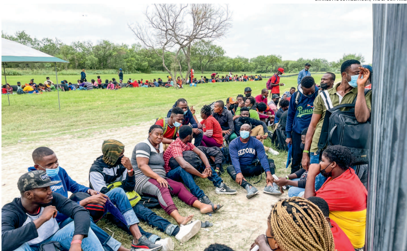
A group of illegal immigrants wait for Border Patrol after crossing the Rio Grande from Mexico into Del Rio, Texas, on July 25, 2021.

Each day, Riggs estimates that between 30 and 40 illegal aliens of various nationalities will walk into the city