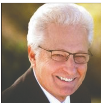
• David Green – Founder and owner of Hobby Lobby