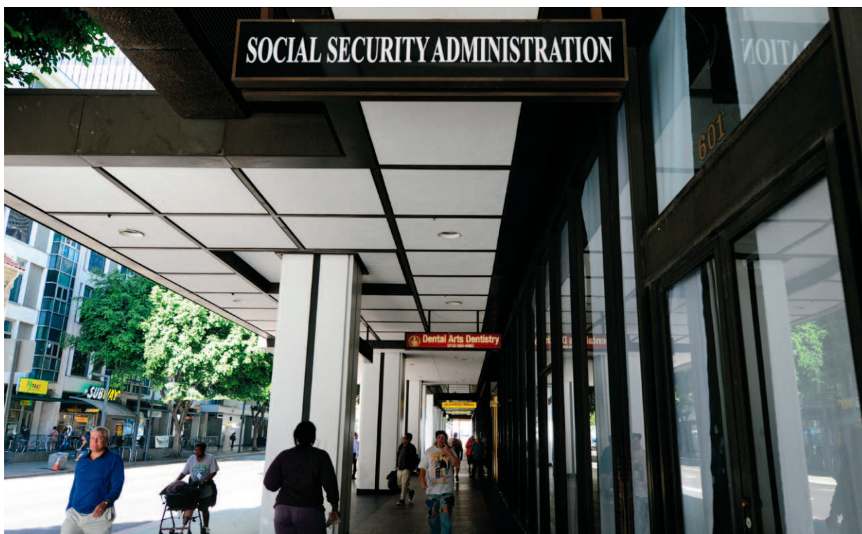
Pedestrians walk past the Social Security Administration office in downtown Los Angeles, in this file photo.

"Yesterday's reports on the financial status of various Medicare and Social Security trust funds once again identify unsustainable benefit promises in Medicare and Social Security programs," Sen. Mike Crapo (R-Idaho) said in a statement