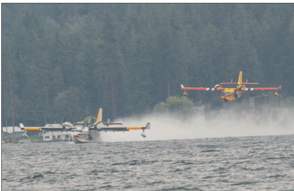
Two Super Scoopers work the 25 Mile-five Mile Creek Fire last week in the area Lake Chelan State Park.

Weather and Fire Behavior: Clear sunny skies are expected today, with a warming and drying trend. When wind alignment with terrain occurs, the higher tempera-