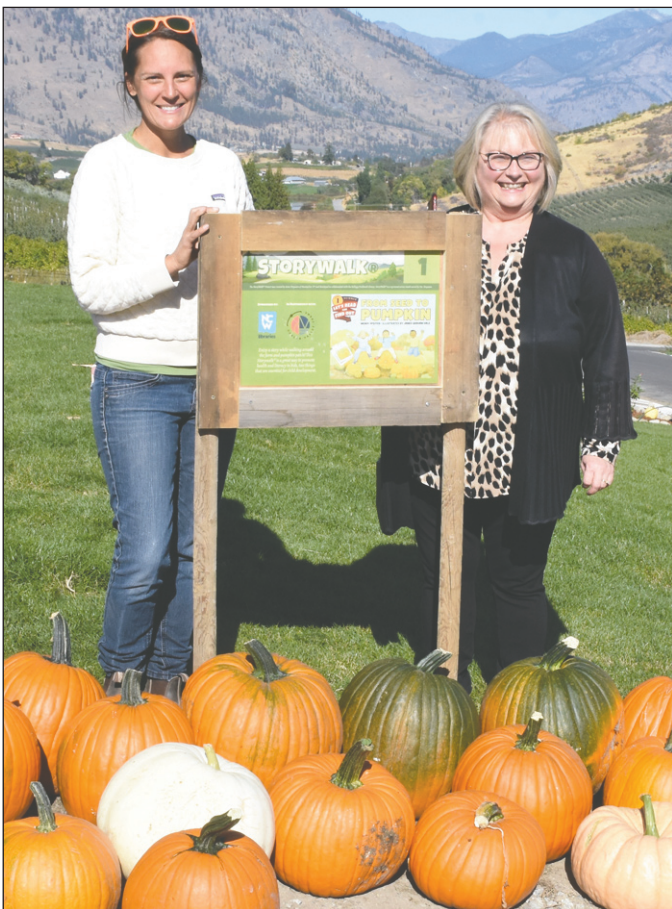
All Manson elementary students will visit the farm in October to learn about farm life — and pumpkins! The farm at 2393 Green Ave. is free to visit and is currently

The story book project is a collaboration between NCW Libraries, Chelan Valley Farms and two Manson High School seniors — with a generous donation of materials from Lake Chelan Building Co. The library district donated the book pages, the students built 16 page frames as part of the community service hours that all Manson seniors must complete, and Chelan Valley Farms is hosting the book walk.