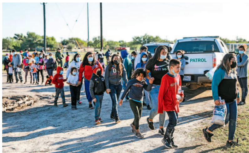
Border Patrol agents apprehend and transport illegal immigrants who have just crossed the river into La Joya, Texas, on Nov. 17, 2021.

Nearly 1.7 million illegal immigrant arrests have taken place this year. The government projects that total to rise above 2 million by the end of 2021. An untold number of others have evaded