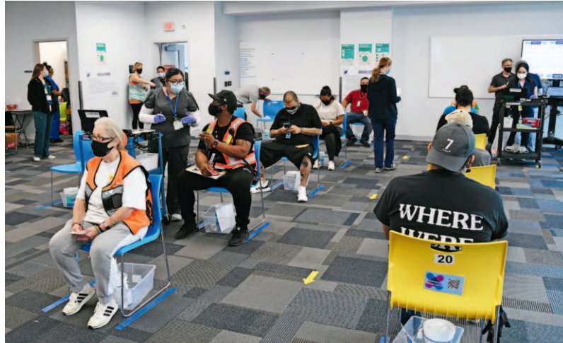
COVID-19 vaccinations are administered to employees at an Amazon fulfillment center in North Las Vegas on March 31, 2021.

mation on Nov. 12, it stated that the Biden administration's vaccine mandate “raises serious constitutional