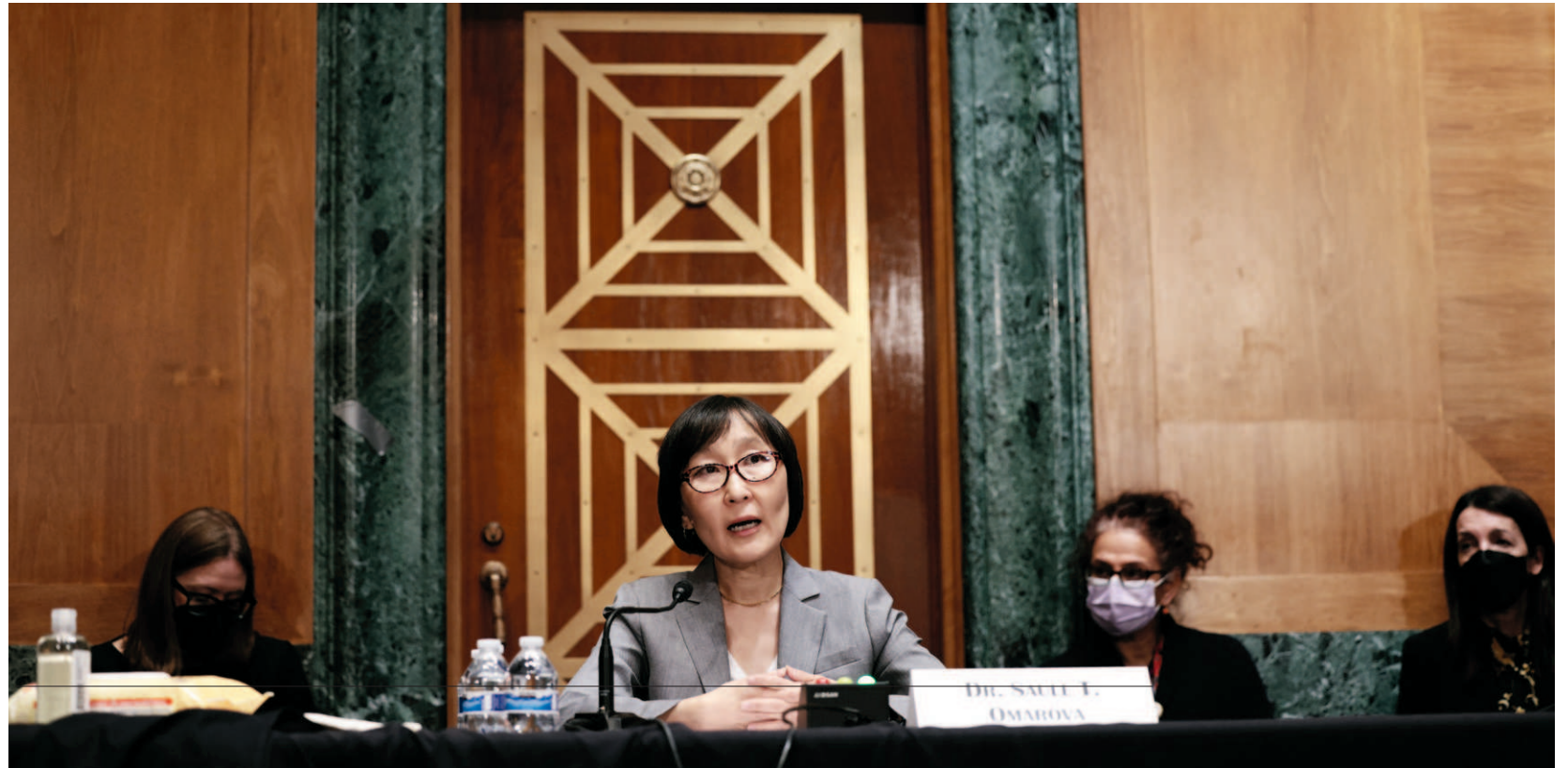
Saule Omarova during her nomination hearing to be the comptroller of the currency before the Senate Banking, Housing, and Urban Affairs Committee, on Capitol Hill in Washington on Nov. 18, 2021.

Her paper does mention digitization proposals as well as the idea of allowing people to open Fed accounts without abolishing private banking, Toomey acknowledged. But