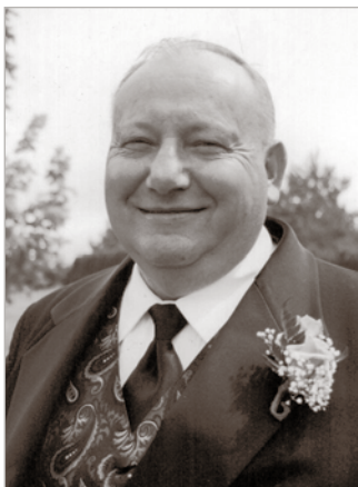
in Grandview, Washington in 1959.