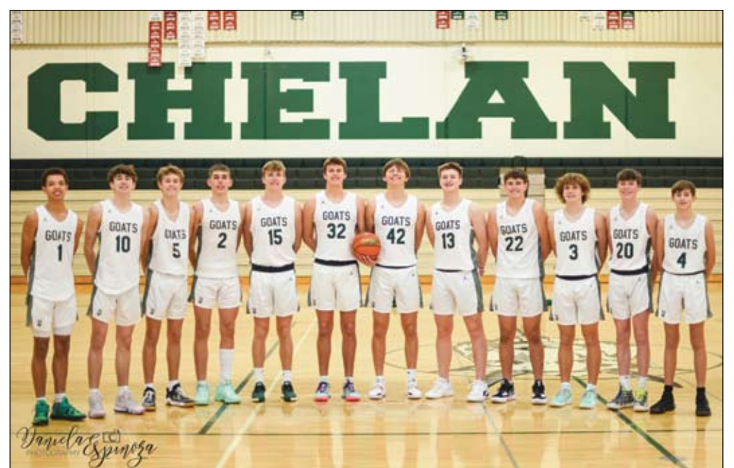
Chelan High School 2021-2022 Boys Varsity Basketball Team.