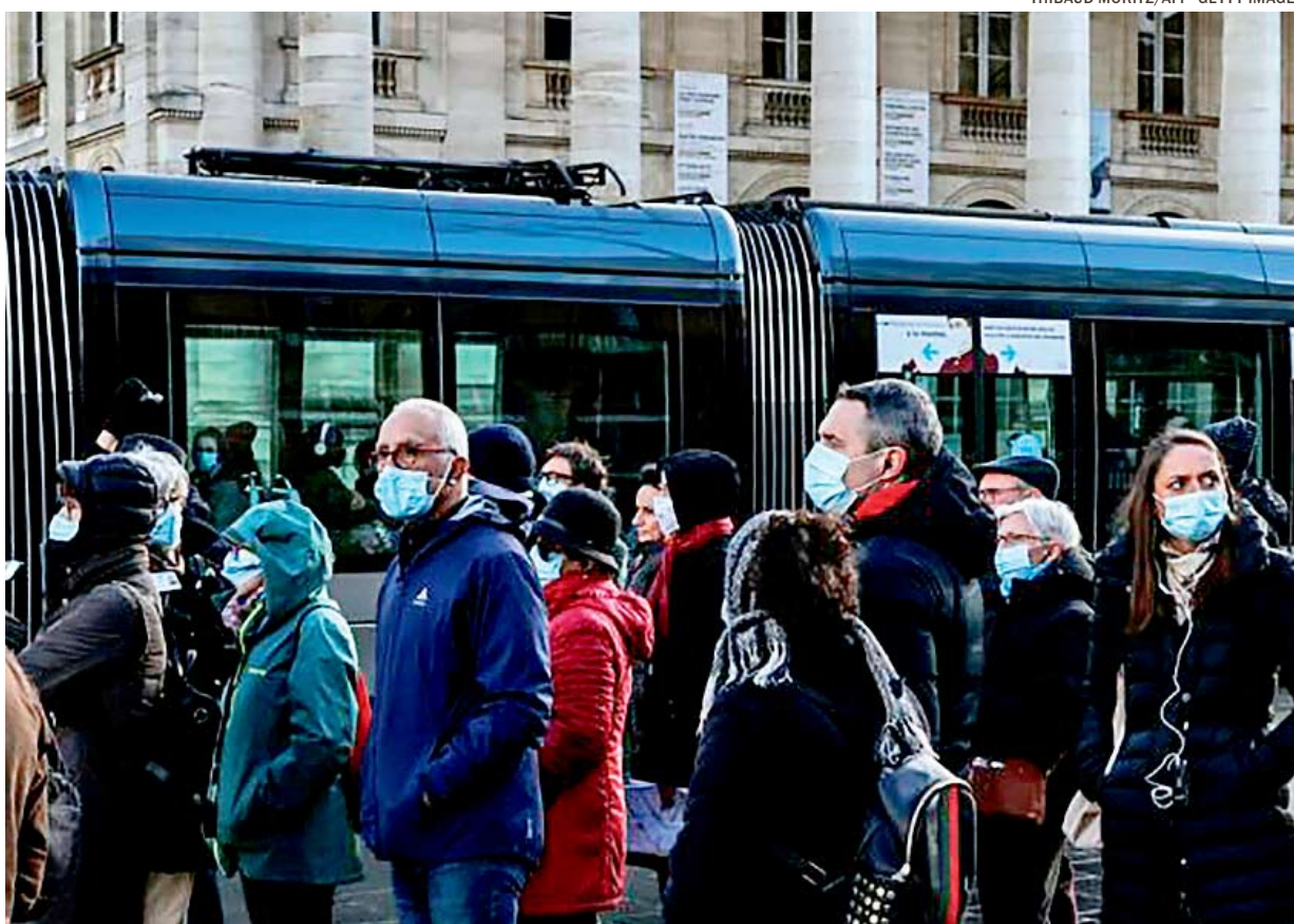
A group of tourists in Bordeaux, southern France, on Nov. 27, 2021.

A statement on Nov. 26 from the country's Ministry of Health and Wellness noted that the four individuals, who are foreign diplomats from an unnamed country, initially tested positive for COVID-19 on Nov. 11. Genomic sequencing later revealed that the travelers had the new variant.