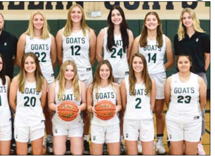
Chelan High School 2021-2022 Girls Varsity Basketball Team.

The Chelan Lady Goats faced the Eastmont Wildcats in a high pressure, scrappy contest in East Wenatchee Friday night, Dec. 3. The game started slow offensively as both teams sought to figure out the chinks in the other's armour. The score at the end of the 1st quarter was reflective of the type of defensive game as it finished in an 8-8 tie. The Goats began to find some wiggle room in the 2nd quarter mainly by penetration and post play. The Goats upped their game defensively as they didn't allow a single point scored by Eastmont in the 2nd quarter and entered halftime with a 19-8 lead. The Goats continued to find success with their defensive pressure in the 3rd quarter and went into last quarter with a 33-18 lead. The Goats continued to tighten the screws down and gave the Wildcats trouble however the Wildcats didn't let up either and caused problems in the backcourt for the Goats. "On a high note our fitness level this year is night and day compared to last season allowing us to not let up on