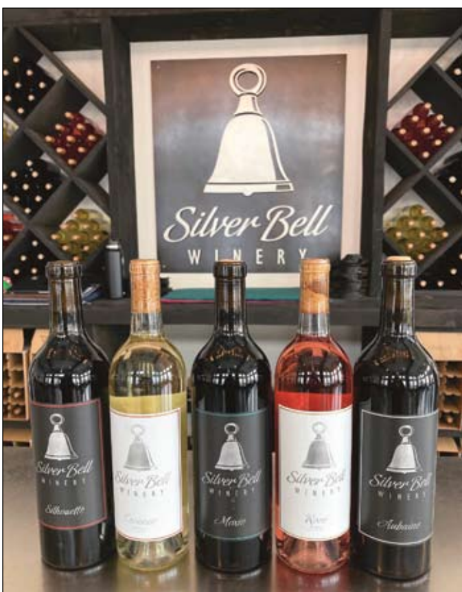
Silver Bell Winery currently has three red Bordeaux blends, a white Bordeaux, and a rosé. RIGHT: Silver Bell Winery is located at 21 Veroske Road.