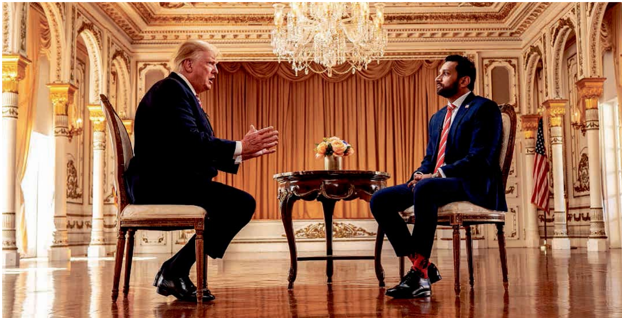
Former President Donald Trump speaks with Epoch TV's Kash Patel at Mar-a-Lago in Palm Beach, Fla., on Jan. 31, 2022.