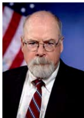
John H. Durham, U.S. attorney for the District of Connecticut since February 2018.