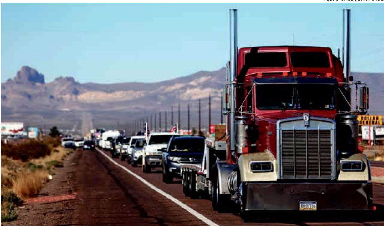
Participants in the People's Convoy to protest COVID-19 mandates, in Golden Valley, Ariz., on Feb. 24, 2022.