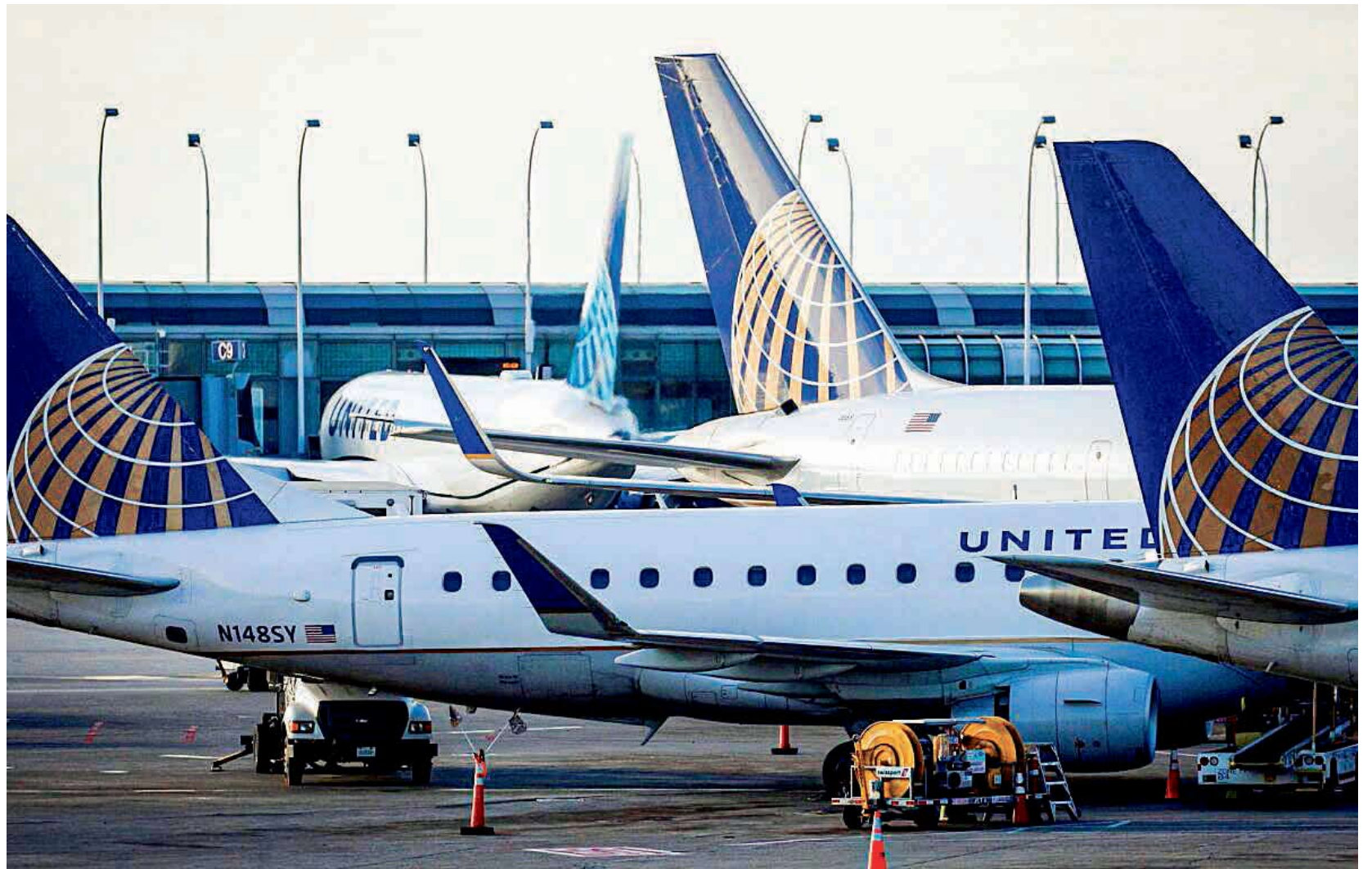
United Airlines planes are parked at O'Hare International Airport in Chicago on Nov. 20, 2021.

The policy triggered a lawsuit, which is ongoing. In a ruling in February, a federal court said United's