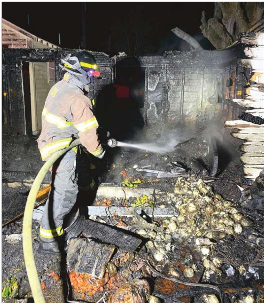
At 4:09 a.m. on March 10, crews from Chelan Fire & Rescue and Chelan County Fire District #5 (Manson) were dispatched to a reported structure fire on Azwell Road in the northern part of the fire district. First arriving crew reported a small storage structure with possible exposures and were able to contain the fire immediately with the resources on scene. Chelan Fire & Rescue crews remained on scene for overhaul until 5:43 a.m. The property owner stated the out building was being used for storage and that there was a space heater inside being used to prevent vegetables from freezing. Cause of the fire is currently under investigation and there is no damage estimate available at this time. Chelan Fire & Rescue would like to remind community members to please use caution when using space heaters by providing adequate space around the heater to prevent accidental ignition of combustible materials.