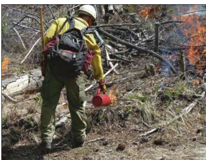
A Forest Service employee uses a drip torch to ignite forest debris and dried grasses during a planned prescribed burning project on the Okanogan-Wenatchee National Forest.

Residents and visitors can expect to see and smell some smoke during burning operations. Even though smoke from prescribed fire is usually light and doesn't last long, it is important that smoke-sensitive individuals plan ahead and be prepared. For more information on smoke and public health, please visit