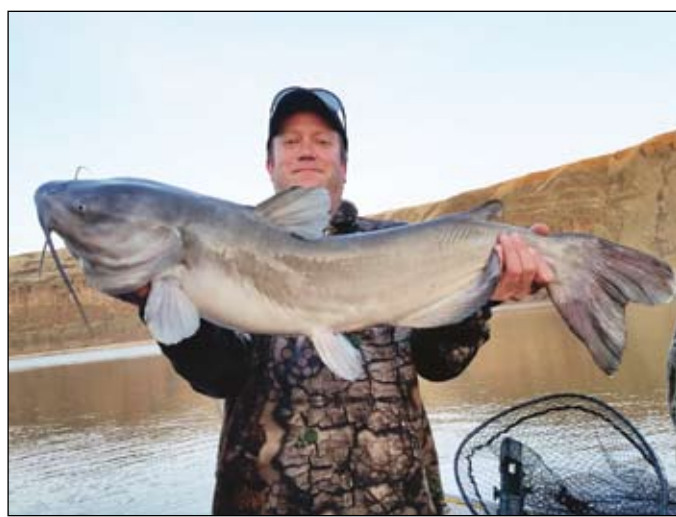
A big channel catfish caught at the mouth of the Palouse River

The spring turkey hunting season kicks off Friday, April 15 and the best place to go is Northeast Washington where more gobblers are harvested than anywhere else. If you are looking for public lands to hunt on biologists with the Washington Department of Fish and Wildlife suggest trying the LeClerc Creek and