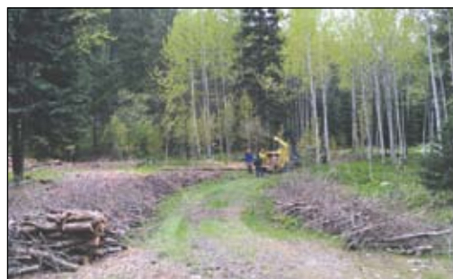
LEFT: What is allowed: Trees and limbs up to 8 inches in diameter - trimmings and brush. RIGHT: Not allowed: noxious weeds, sod, animal waste, garbage, plastic bags, root balls, pine needles, or leaves.