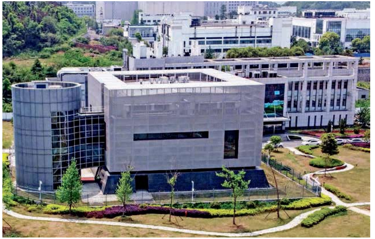
The P4 laboratory at the Wuhan Institute of Virology in China's central Hubei Province on April 17, 2020.

On June 16, 2020, NIH officials reversed themselves and deleted the genetic sequencing data, as requested by the Wuhan researcher. That researcher was quoted by EO as explaining to NIH: "Recently, I found that it's hard to visit my submitted SRA data, and it