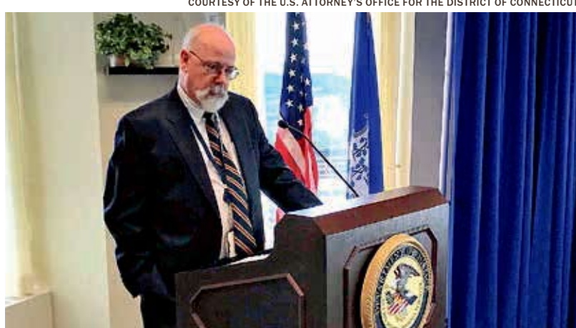
John Durham speaks at a conference in New Haven, Conn., on Sept. 20, 2018.

Sussmann and his lawyers have been pressing the judge to dismiss the case prior to trial, arguing that the lie about not bringing the information on behalf of a client wasn't material to the information itself.