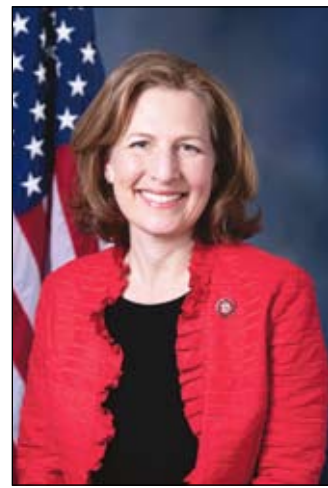
Congresswoman Kim Schrier

Schrier said that she does not know how long the food and fuel crisis will last. She said that the crisis is occurring worldwide, and that Congress is working hard to make citizens' lives easier and reduce costs. Schrier emphasized that the effort to reduce costs goes beyond just the costs of food and fuel and extends to other parts of life like childcare, preschool, and the cost of prescription drugs.