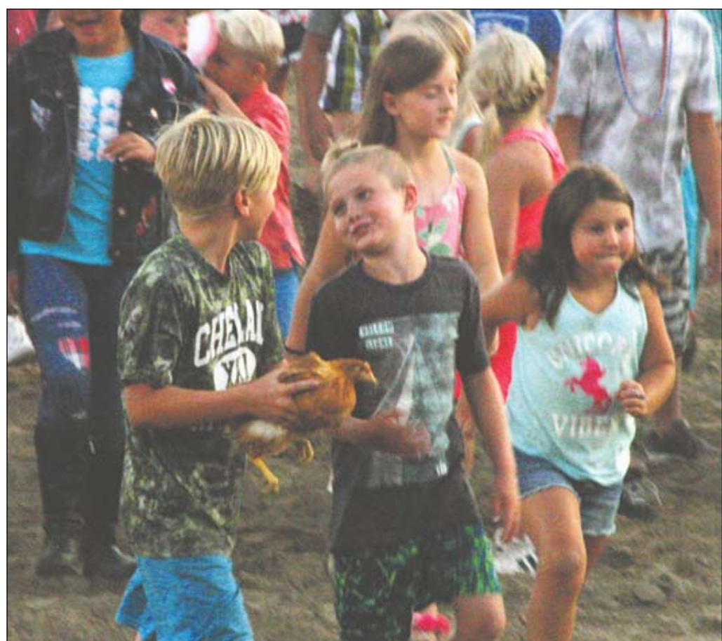
Rodeo parade Thurs., July 14, 7 p.m.