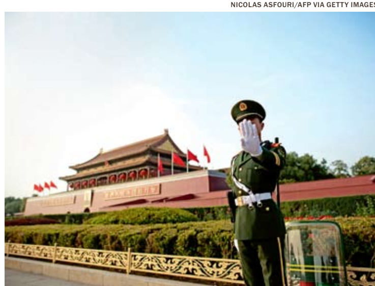
A Chinese paramilitary soldier stands near Tiananmen Square during the Communist Party's 19th Congress in Beijing on Oct. 22, 2017.

McCallum said the purpose of the statement wasn't to demonize the Chinese people nor to cut off China's