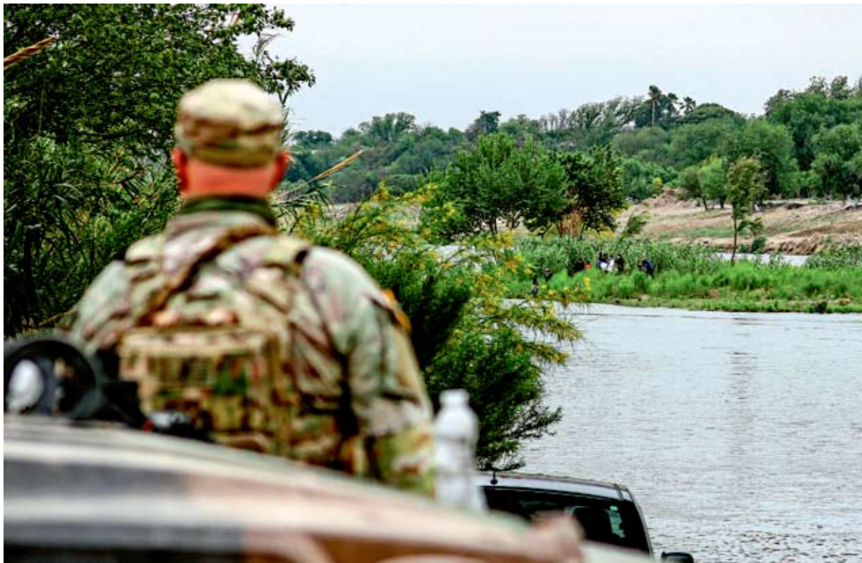
A Texas National Guardsman watches as a group of Cubans crosses the Rio Grande from Mexico toward the United States in Eagle Pass, Texas, on April 19, 2022.

boldened and enriched by President Biden's open border policies, smuggling in record numbers of people, weapons, and deadly drugs like fentanyl," he said in an accompanying statement.