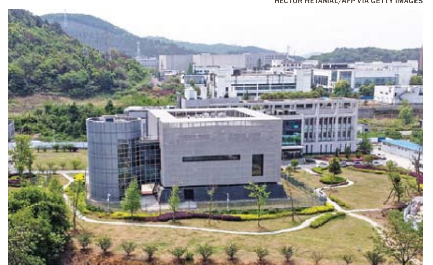
The P4 laboratory at the Wuhan Institute of Virology in Wuhan, Hubei Province, China, on April 17, 2020.

In the project that took place under the fifth grant, from June 2018 to