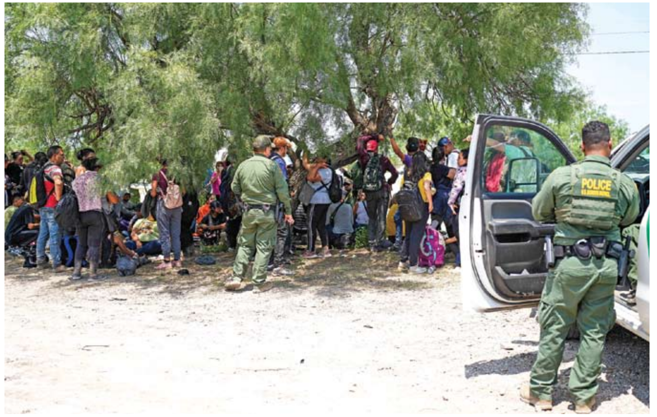
Border Patrol agents apprehend a large group of illegal immigrants near Eagle Pass, Texas, on May 20, 2022.